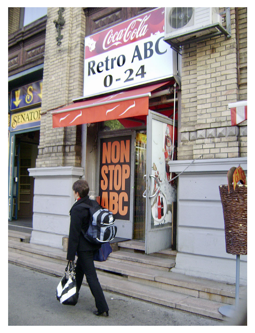
FIGURE 1: Retro ABC convenience store in Budapest, referencing the state-owned ABC chain started in the 1970s. Author's photo, 2014.

lobby, little changed since socialist times, advertised a " retro burger " on its chalkboard menu. Friends of mine in their fifties redecorate "retro" rooms in their homes with new furnishings manufactured to look like 1970s styles, or old and somewhat dilapidated décor now imbued with new value. "Retro" has also