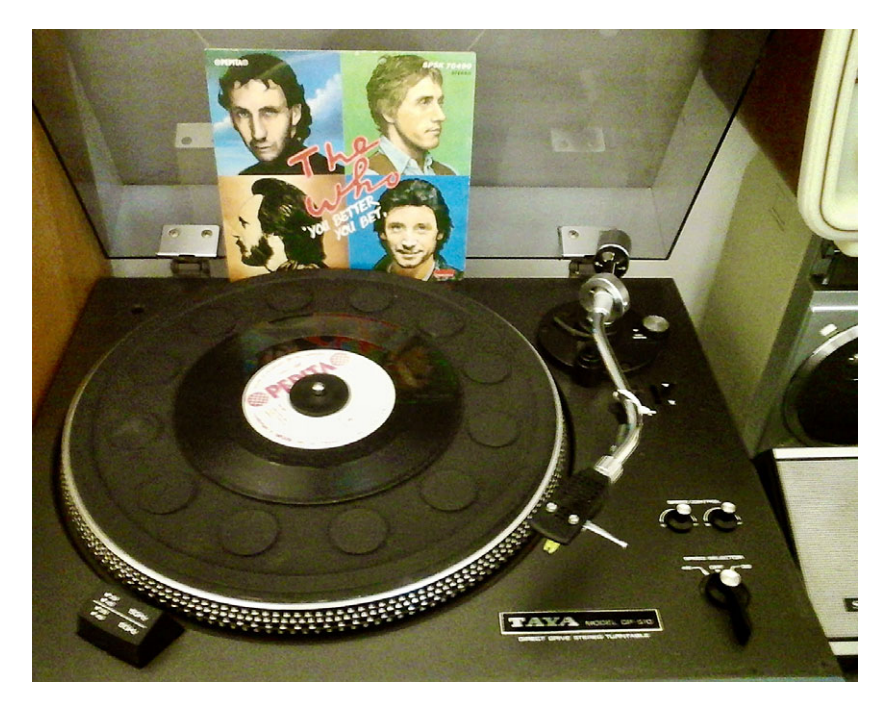
FIGURE 14: A Japanese TAYA turntable, with a 45 r.p.m. record by The Who, put out by the Hungarian label Pepita. Author's photo, 2014.

This exhibit was a concrete example of how "retro" collections are displayed to differentiate them from both "socialist nostalgia" and "kitsch." Socialist nostalgia collections are characterized by affection tinged with loss (Nadkarni 2020: 85). While they sometimes valorize the remembered superiority