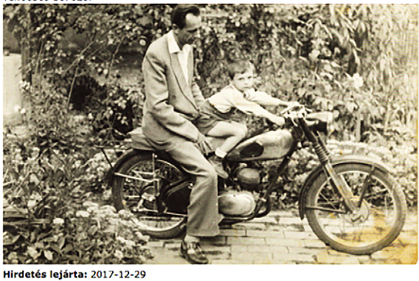
FIGURE 20: Csepel motorbike photo post to Retronom.hu, 2016. Screengrab, 2017.

of him (figure 20). The description reads: "Greetings! Can someone help with what type of Csepel this was? It was surely manufactured for export. Chrome tank, teleskop, and drum brakes too!!! Thanks in advance!!!!" These questions suggest the point of posting was not to elicit nostalgic sentiments, but to find out more about the design and export value of this Hungarian-made technology of modern mobility: to ascertain its value and what it said about the people that possessed it.