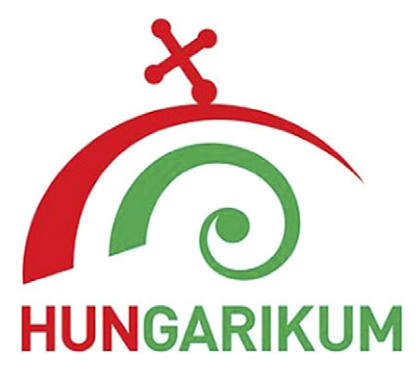
FIGURE 5: Hungarikum logo of crown with tilted cross. Used with permission of the Hungarian Agriculture Ministry, 2021.

determines if something is worthy of representing "the high performance of Hungarian people thanks to its typically Hungarian attributes, uniqueness, specialty and quality."<sup>20</sup> The Hungarikum logo (figure 5), a stylized motif of the ancient crown with tilted cross, indexes the kinds of products that tend to qualify, namely those with strong associations with traditional, regional Hungarian heritage from Szeged paprika and Tokaj dessert wines to breeds of hunting dog, or iconic trademarked brands like Pick Salami, Zwack Unicum bitters, and Herend porcelain.<sup>21</sup> In keeping with nation-branding efforts of early decades, almost nothing innovated and mass-produced during the state-socialist decades has qualified.