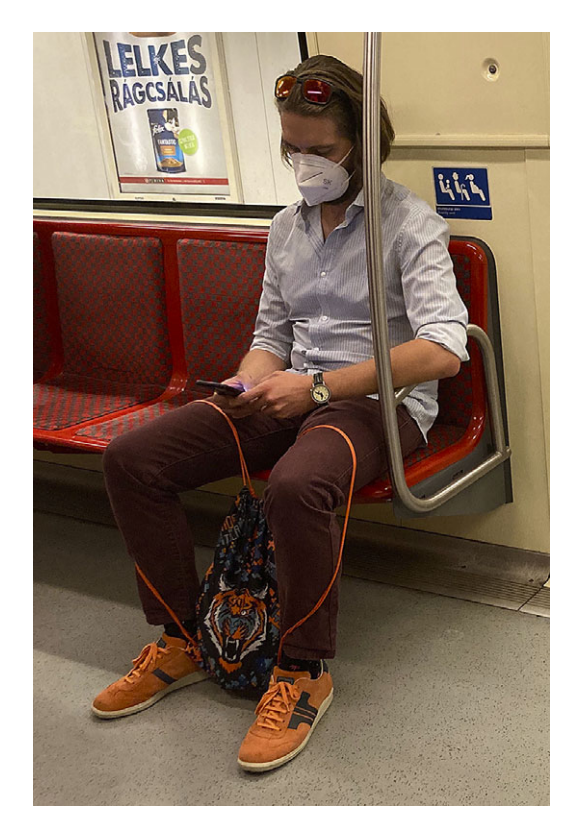
FIGURE 8: Tisza shoes on the Budapest metro. Author photo, 2021.

industries (figure 8). In the 2010s, Tisza fans from this demographic commented to me or on Facebook that they liked taking foreign visitors by the store to see an exemplar of Hungarian quality and style reaching back to the 1970s. The politics of Hungarian Retro for these consumers are not about questioning the political economy of contemporary capitalism, beyond a "buy Hungarian" consumer citizenship. It is thus not surprising that I found admirers of the brand from across the political spectrum. Tiszas are seen as a genuinely Hungarian product, one that provides material evidence of continuous Hungarian participation in regimes of value that matter today as both consumers and designer-producers of an internationally desirable product.