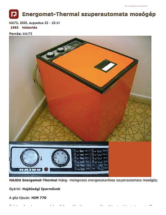
FIGURE 19: HAJDU Energomat-Thermal washing machine, 1983, Retronom.hu. Screengrab, 2020.

sought-after good, after the Hungarian socialist version of Monopoly, was the Hungarian HAJDU Energomat-Thermal Washing Machine from 1983 (figure 19), and not the Soviet Eureka ridiculed by talk show hosts as socialist kitsch (Pope-Fischer 2017). Indeed, the durable material capacities of some goods form the basis for new forms of sociality. Membership in the Hungarian Riga Moped Club, for example, requires ownership of a working Riga, Verhovina, Delta, Stella, Fora, or Kárpátia moped—all brands made in Soviet Eastern Europe and sold in Hungary. Club members communicate via their webpage about the bikes, parts, and repair, and organize excursions for the mostly older members.