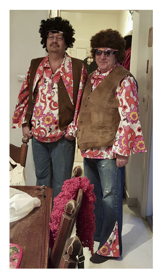
FIGURE 3: Getting ready for a Hair -themed New Year's Eve party in Dunaújváros, 2015. The 1979 Miloš Forman film, based on the 1968 American musical, was a counter-culture phenomenon in 1980s Hungary. Photo used with permission.

state socialism collapsed, goods produced during the era were a reminder of a controversial past. The politicized remains of an authoritarian Soviet state (busts of Lenin, red stars) were quickly taken up and mobilized by political actors positioning themselves by opposition to the evils of "Communism in absentia " (Gal 1994). But the commercial material and popular culture of everyday life was also a source of discomfort, exacerbated by the response of Western tourists. Tourists sought out the titillating, political symbols of their Cold War "other," but were also drawn to the unfamiliar mass-produced and branded consumer goods of a so-called alternative modernity. These live on as Communist Kitsch, successfully marketed to tourists in themed cafes and tours, and simultaneously