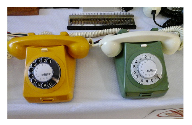
FIGURE 12: MM rotary-dial telephones of the state-owned company. Author's photo, 2014.

A century's worth of telecommunications and music technology was set out with a similar logic. One table held a switchboard set from the 1920s, colorful and sturdy circular dial phones from the 1970s and 1980s (figure 12), as well as the technology that had inspired the entire collection: the succession of cell phones (figure 13). Above it, a poster board educated attendees on the history