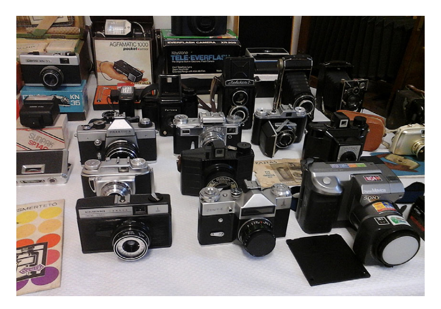
FIGURE 11: Table with cameras, Retro Exhibit. Author photo, 2014.

The rest of the exhibit was a cornucopia of technologically obsolete, brand-name consumer goods displayed in similar fashion. The largest collections were of cameras, telephones, and stereo equipment. The camera display (figure 11) included an antique wood and brass accordion box camera alongside an East German Praktica, the Soviet SMENA, and the Zenit-E, a West German Agfamatic pocket camera, a Keystone Everflash with "Made in the USA" prominent, a Kodak instant camera, the Hungarian Pajtás box camera, the SONY digital Mavica, and a Soviet PYCb home movie projector. Some were displayed with colorful but faded packaging or a user manual. In setting out these cameras, no effort was made to mark off historical periods, conventionally defined, nor to indicate Cold War divisions of East and West. Here Japanese, Soviet, Canadian, Hungarian, East German, and American brand name cameras were assembled as evidence for Hungarian