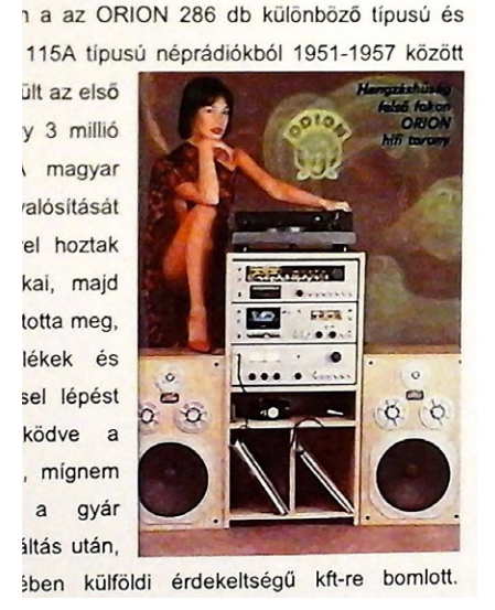
FIGURE 15: Section of Orion Electronics Company board, with inset advertisement.

In this narrated trajectory, there is no reference to a "socialist era," nor to the discontinuities created by shifting from private company to state-owned firm to holding corporation. Instead, the twentieth-century history of the company is unified by the brand names Videoton and Orion, the Latinate names and modern logos the companies did not receive until the 1960s. Instead of central planning, the text emphasizes the market competition between state-owned firms as well as between firms within COMECON for major contracts.