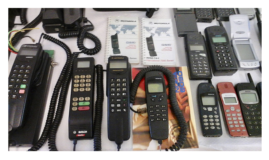
FIGURE 13: Cell phones, Retro Exhibit. Author's photo, 2014.

<sup>27</sup> See Crowley (2008) on amateur film and photography in state-socialist Poland and East Germany.