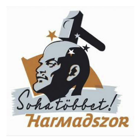
FIGURE 4: "NEVER AGAIN, the third time." Logo for auction held in December 2010, ridding the state of its collection of state-socialist art and artifacts.

In this highly politicized context, it is tempting to see retro in Hungary as another version of socialist nostalgia. There is considerable overlap in content,