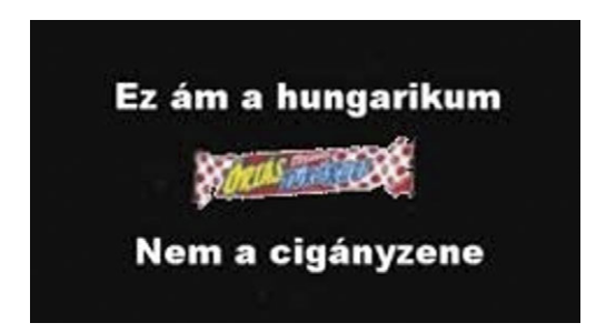
FIGURE 22: Online post of the Túró Rudi as Hungarikum. Screengrab, 2014.

diametrically opposed to right-wing nationalism in Hungary. Indeed, some sympathizers with neo-nationalist groups oppose retro's revisionist narrative, in part because of their virulent anti-Communism. Others reject it in much the same way a right-wing nationalist in the United States might reject hipster style as undignified and incompatible with their "Hungarian" identity. As we have seen, right-wing groups champion Hungarian mythic exceptionalism for a domestic audience, consuming commodities like nationalist fashion brands, irredentist stickers, and heavy metal music. Likewise, the nationalist, conservative Fidesz government promotes "uniquely" Hungarian, traditional places and products that predate the state-socialist period (image 22).