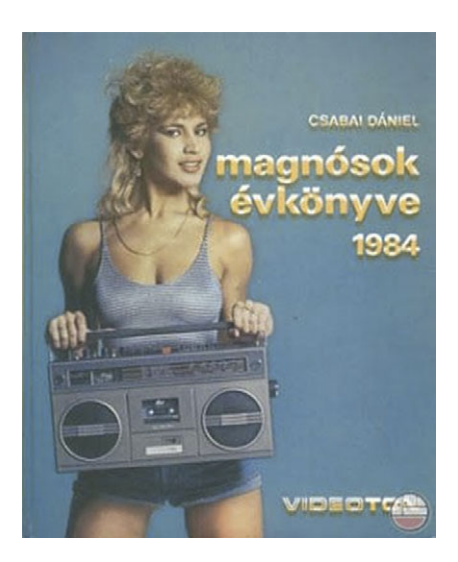
FIGURE 17: Videoton boombox ad from 1984. Screengrab, 2020.

Central to all of these was their design and the ways they were advertised and otherwise circulated on television, radio, and the pages of newspaper and glossy magazines, producing an apolitical dreamworld of commercial modernity in state-socialist Hungary. The same set of iconic commercial posters for wellknown Hungarian companies and their branded products in Retronom.hu are also featured on Pinterest and Instagram retro sites. These include the classic Art Deco poster for Tungsram lightbulbs from the 1920s, the Csepel motorcycle poster from the 1940s, and various ads for Fabulon suntan lotion and cosmetics from the 1970s. Videoton and Orion circulate as much for their sexuallyprovocative ads—themselves important indexes of the modern—as for the quality of their products (figure 17).