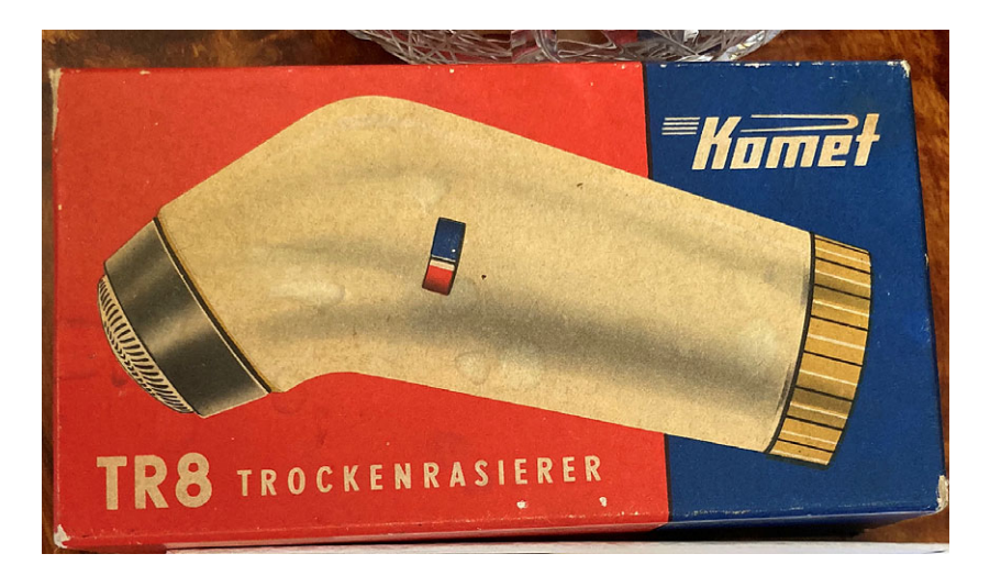
FIGURE 2: The Komet TR8 electric razor from East Germany, part of a friend's collection of old technologies that he now refers to as "retro." Rácalmás, Hungary. Author's photo, 2021.

become the favored term for online photo archives as well as for "retro" exhibits (obsolete computer consoles, toys, typewriters, newspaper clippings, lamps, soda bottles, cell phones, etc.) that have emerged around the country as high-school history projects, in local museums, and as private collections (figure 2). The American musical Hair ; a hit in 1980s Hungary, has also made a come-back in staged revivals and theme-parties (Figure 3).