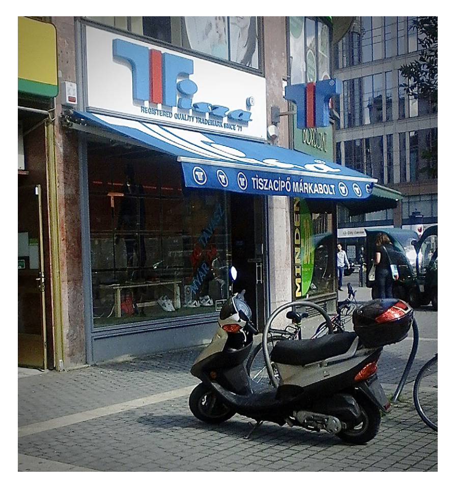
FIGURE 7: Tisza's own-brand store in downtown Budapest.

The sign over the Tisza Cipő store front (figure 7) proclaims: "Registered quality trademark since '71," referring to the year the state-owned shoe factory's management registered the "T" logo and, following trends emerging in Euro-American markets, integrated the logo into the sport shoe's design. A young salesman with ear gauges told me that these had been good enough to attract the attention of Adidas, which then subcontracted with the Tisza factory to produce a