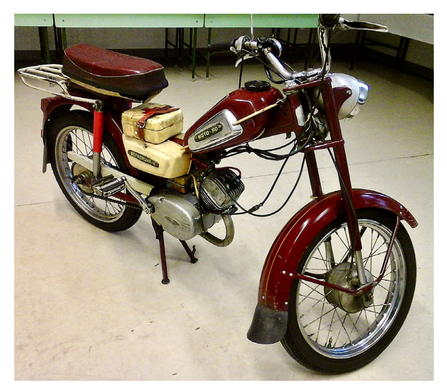
FIGURE 9: Verhovina motorcycle, Retro Exhibit.

Bús explained that the collection had started by chance when he found himself with multiple cell phones from the 1990s that had rapidly become obsolete. Instead of discarding them, he added to his collection through donations and purchase, gradually amassing enough to fill a storage shed. The centerpiece of the exhibit was the iconic object of 1960s international youth culture, the motor scooter, but instead of an Italian Vespa, this was a dark red Verhovina, mass-produced in Soviet Ukraine and imported to Hungary in the 1970s (figure 9).