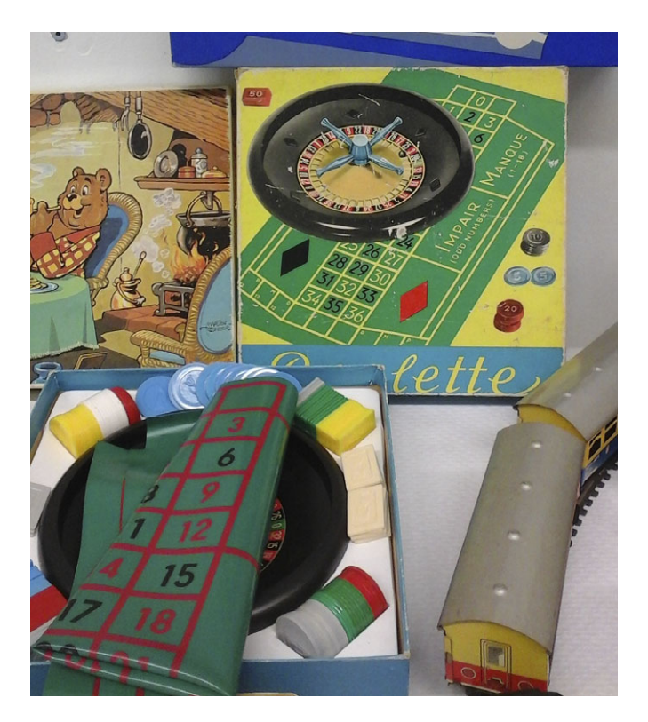
FIGURE 10: Roulette Game, Retro Exhibit.

The table was also decorated with awards, service medals, and "best mechanic" pendants in wine-red or the Hungarian tricolors (red-white-green), embossed with the acronyms of factory-firms. On one of these, one could