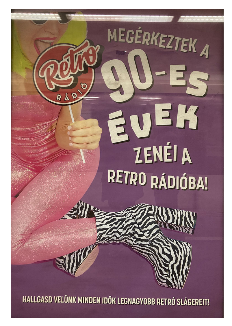
FIGURE 23: Poster in a Budapest metro station: "Music from the 90s has arrived at Retro Radio!" Author's photo, 2021.

greatest hits from the 60s, 70s and 80s," and then adding the 1990s (figure 23). It remains to be seen whether Hungarian Retro's de-stigmatizing of the commercial culture of socialist-era decades might eventually lead to reevaluations of other aspects of the state-socialist system itself.