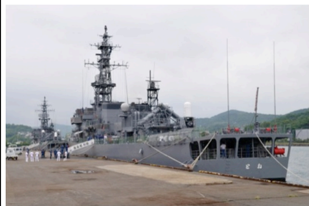
Maritime Self Defense Force Warships at Minamata

If anything has been proven by the endless debates about when or whether the "postwar" has ended, it is that Japan has never escaped the long shadow of its Asia-Pacific War. The "postwar" was declared over many times, including when the Allied Occupation ended in 1952, again when the nation's GNP regained its prewar peak in 1955, when Japan's economy passed that of West Germany in 1968 to become the third largest in the world after those of the USA and the USSR, the two superpowers of the day, once again in the 1980s when Japan was the world's largest creditor and foreign aid donor and home to the world's ten largest banks, and in 1989 when the Shōwa emperor died after 63 years on the throne. Some still believe the end of the postwar has not yet arrived.