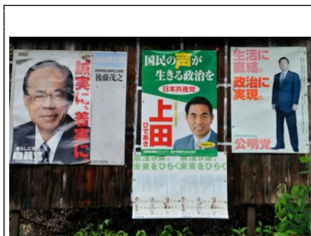
Election posters, Tsumago

( Bloomsbury 2013 ), grew out of two gatherings of scholars of postwar Japan. Unlike many pundits over the past two decades, the participants in the 2009 conference "Revisiting Postwar Japan" at Sophia University in Tokyo, and a workshop at the University of London's School of Oriental and African Studies in 2010, did not take for granted the value of studying Japan since 1945. In that volume, we focused on four issues: civic life, the legacies of war and military occupation, the emergence of a postindustrial economy, and the interaction of public memory with the social, political, and economic trajectories from the postwar to the post-bubble era. Our goal was to paint a more robust portrait of Japan's contemporary history by examining the social, cultural, and political underpinnings of Japan's postwar and postindustrial trajectories. More broadly, our ongoing collective goal is to cross the intellectual boundaries where history leaves off and other disciplines begin, in order to put to rest popular dismissals of Japan's relevance in the twenty-first century world.