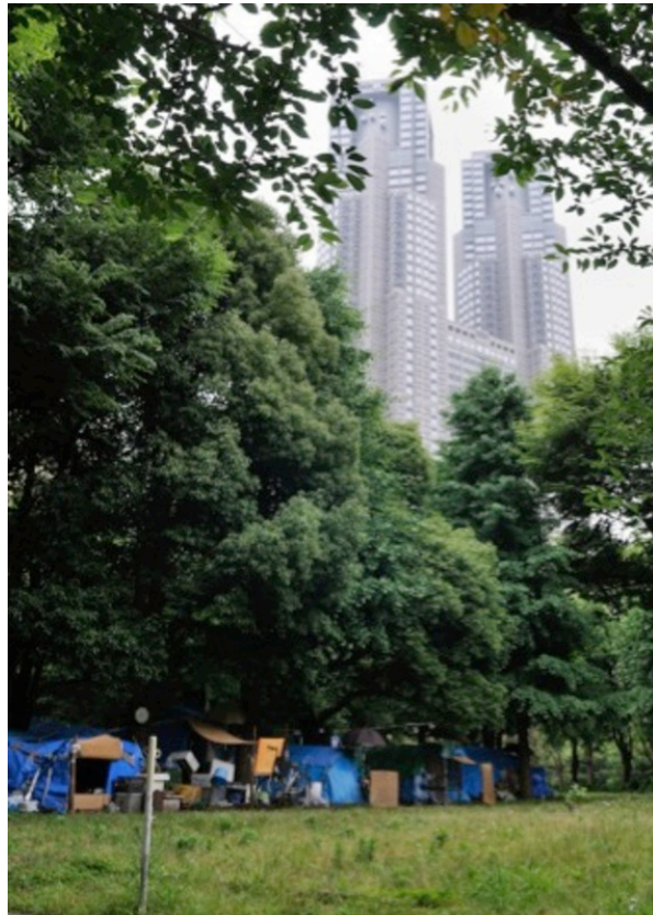
A homeless camp in the shadow of Tokyo's city hall, ©Timothy S. George

The economic bubble burst in 1991. Housing prices plummeted and suicide rates skyrocketed. Along with the increasingly bleak economic outlook came cultural and social issues that included the re-emergence of teenage prostitution ( enjo kōsai , or compensated dating), along with increasing rates of unemployment and homelessness, all of which had been ubiquitous in prewar and Occupation-era Japan. Japan's long nineties, also known as the lost decade, stretched well into the twenty-first century. In 2002, the official national unemployment rate exceeded 5 percent for the first time since the early 1950s. When disaggregated, the data revealed a more troubling concern: the average unemployment rate for persons aged 15-24 was double that for the overall population. All through the decade preceding the 2011 Tōhoku Earthquake,