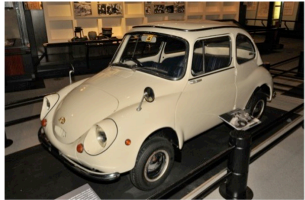
Subaru 360 manufactured from 1958 to 1971