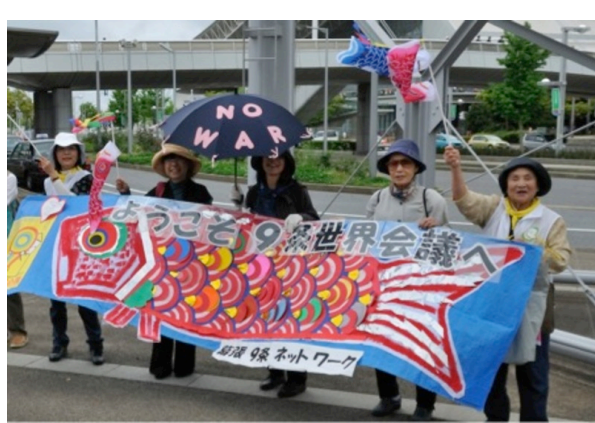
Supporters of the antiwar clause in Japan's constitution at the Global Article 9 Conference, 2008, Tokyo