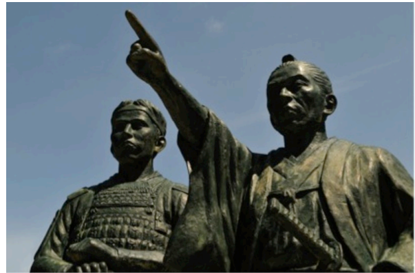
Statues of Bakumatsu heroes Takasugi Shinsaku and Yoshida Shōin, Yamaguchi

Positioning themselves in the dual role of proconsul and tutor, the mostly American officials of the Allied Occupation of Japan (1945-1952) translated their social and political vision of democracy into a constitutional monarchy for Japan that embraced the rights of free speech, formal gender equality and a "minimum standard of cultured living." Yet, while the Allied Occupation is often characterized as a liberal "New Deal" for Japan, reactionary strains within the American political system, in particular the rise of anti-Communism and the onset of the Cold War, also had tremendous repercussions for Japan. They strengthened the hands of its more conservative politicians and left the nation no choice but to join the American side in a polarized world.