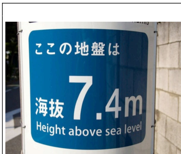
Tsunami awareness in Kamakura

industrialization, shared with other countries with high standards of living, is taken by many to indicate that the inevitable result is the end of affluence for all of us. Japan is now an exemplar of how postindustrial societies cope.