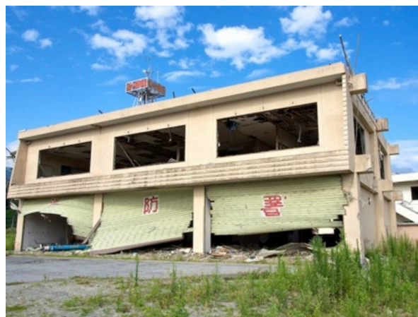
Firehouse devastated by the March 11, 2011 tsunami, Rikuzentakata

the point that it has been quite fashionable to publicly wonder whether Japan really matters anymore. 2