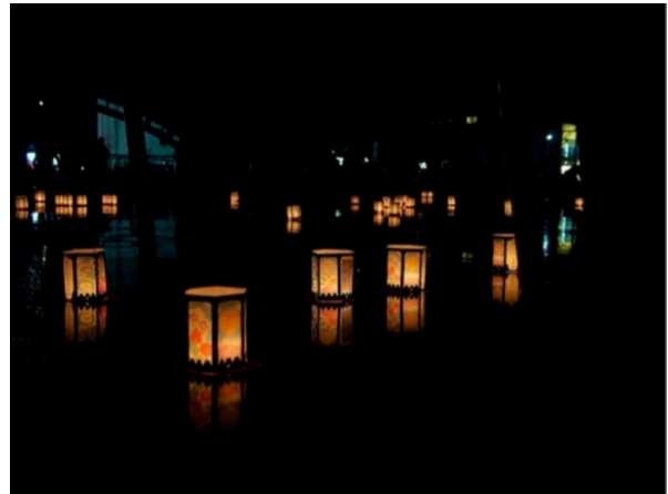
Obon lanterns bearing the names of tsunami victims, Kesennuma

The triple disasters of March 2011 have been described as a break with the past. The contributors to Japan since 1945 do not attempt to predict how those disasters will change Japan or the ways its history is already being told. But we are certain that, whatever directions Japanese take now - and they will most certainly not all take the same direction - they will be building on their pasts, particularly their experiences, accomplishments, and failures, as all societies always do.