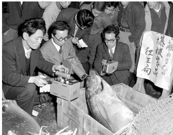
Scientists test tuna for radioactive contamination following the Lucky Dragon No. 5 incident

Dragon #5 was reported on March 16th. The Yomiuri was the first to cover the incident in its morning edition on that day. 62 The tuna boat encountered the hydrogen bomb test on March 1st, and took days to return to its mother port in Shizuoka. Informants of Yomiuri reporters, who saw the fishermen, guessed that they suffered from radiation diseases, based on what those informants had read and learned from Yomiuri 's earlier series. 63 Other major newspapers followed in their evening editions on the same day. The incident frightened many Japanese about the danger of nuclear bomb tests and the potential for nuclear war, as well as igniting fears that their daily life was in danger from radiation-contaminated food like tuna.