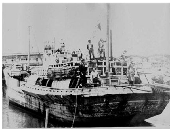
Lucky Dragon #5 returns to port

Nuclear Power Plant following the disastrous earthquake and tsunami of March 11, 2011 raised this question afresh for people around the world. Indeed, the House of Representatives of the Japanese Diet passed a budget for nuclear reactor research in early March 1954, shortly before the Lucky Dragon #5 returned to Japan and the tragedy of its crew was reported to the public.