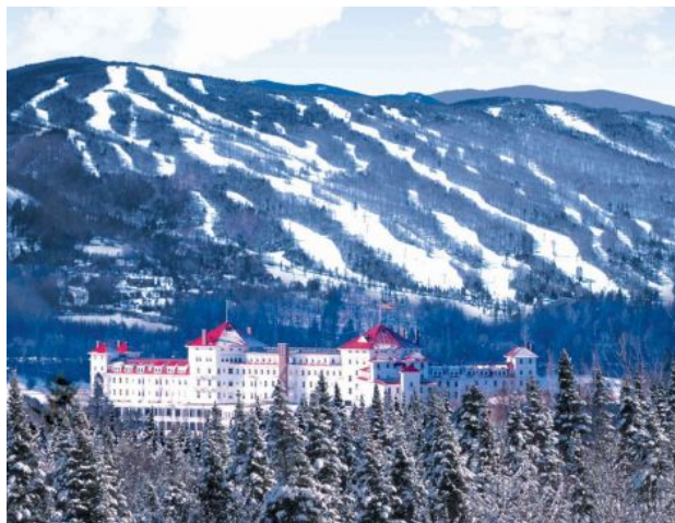
Site of the Bretton Woods conference

in July 1944. Leading British and American economists blamed the Great Depression and, to some extent, World War II on the breakup of the international monetary system in the early 1930s and were determined to create a more stable arrangement in which the dollar would replace the British pound as the accepted global currency. The new system, devised by economists Harry Dexter White and John Maynard Keynes, fixed the dollar's value at $35 for an ounce of gold. National governments, rather than speculators, were to set the value of their currencies in relation to the dollar and would have to disclose any changes in advance to the new International Monetary Fund (IMF).