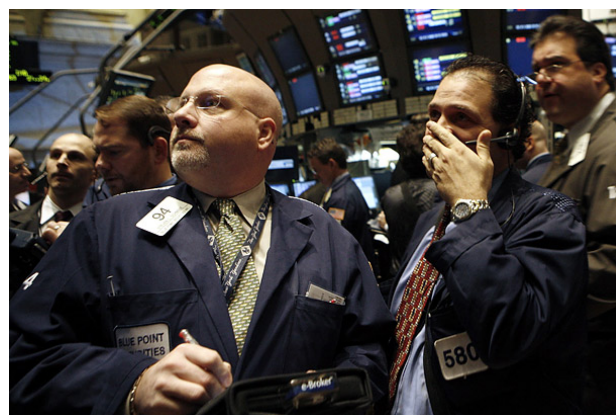
The stock market in free fall in October-November, 2008

international monetary system is in big trouble.