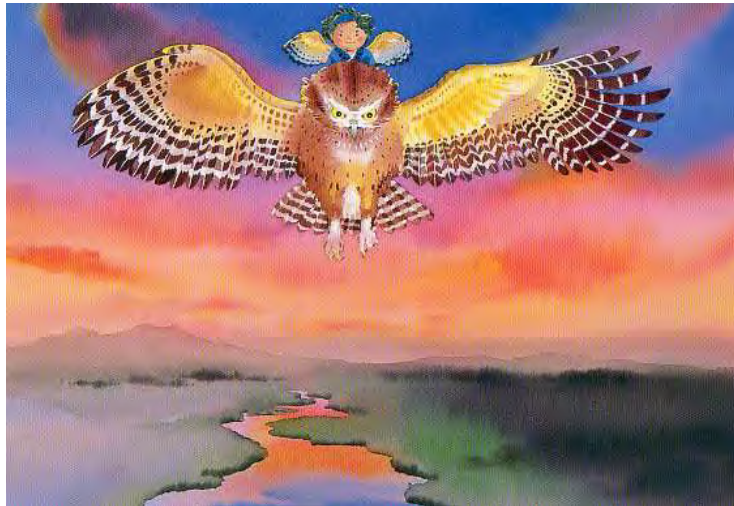
The owl and the child

Chiri Yukie's book contains thirteen songs of gods such as the owl, fox, rabbit, little wolf, sea, frog, otter, and swamp mussel deities, and the spirit of the damp ground. "Silver Droplets Fall" is the first of her collection, and one of the two owl god songs. The owl (or more precisely, in Horobetsu, Blakiston's eagle-owl) is kotan-kor-kamuy , the guardian god of the kotan (hamlet).