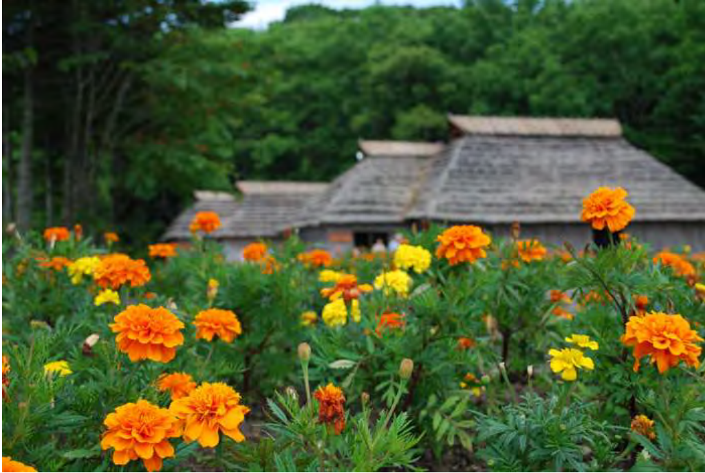
Chise, Ainu home

Chiri Yukie's book contains thirteen songs of gods such as the owl, fox, rabbit, little wolf, sea, frog, otter, and swamp mussel deities, and the spirit of the damp ground. "Silver Droplets Fall" is the first of her collection, and one of the two owl god songs. The owl (or more precisely, in Horobetsu, Blakiston's eagle-owl) is kotan-kor-kamuy , the guardian god of the kotan (hamlet).