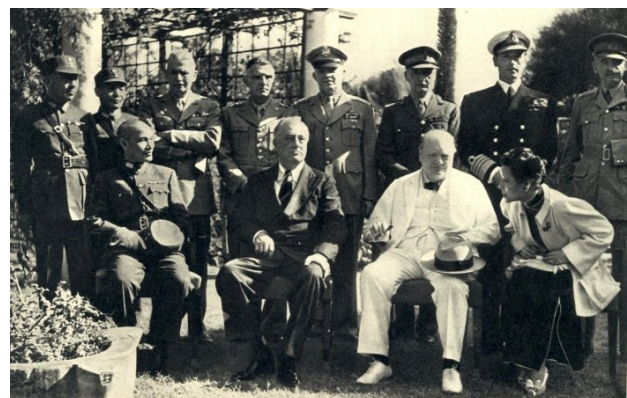
Generalissimo and Madame Chiang Kai-shek flank Roosevelt and Churchill at

The Allied powers formally addressed the issue of postwar Northeast Asian occupation in Cairo, where the U.S., Great Britain, and China signed a communiqué in December 1943. The three signatories proclaimed for the first time that Japan would forfeit its control over the Korean Peninsula. They also agreed to delay Korean independence by adding the often-quoted phrase, "in due course Korea shall become free and independent." The Allied leaders declaring that Japan would lose possession of the Korean peninsula marked an important clarification regarding Korea's post-liberation status. Remarks by American and Japanese officials suggesting that it was a mistake to separate Korea from Japan could be heard both before and after U.S. occupations had begun.