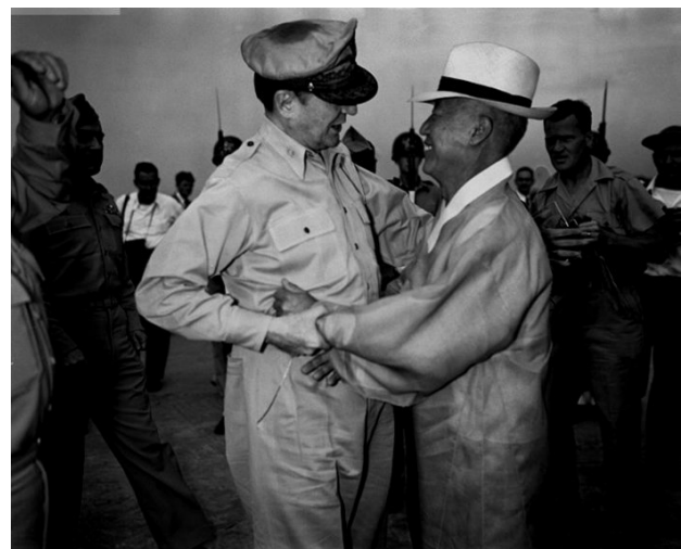
Rhee and MacArthur

[Japan's] reconstruction" be forcefully repatriated. Here he remarked that since they were "mostly North Koreans" ( sic ) they "would [all] have their heads cut off" by the ROK government. [47] Labeling this population as "mostly North Korean" was untrue in that the vast majority of Japan-based Koreans came from southern Korean towns. The idea that MacArthur suggested, that most Koreans were DPRK-influenced communists, was also problematic in its assumption that Japan-based Koreans could only adopt this ideology from a foreign influence. This exchange also suggested as a definition of "communist" any Korean unwilling to contribute to Japan's reconstruction, or, more simply put, a troublemaker. Both leaders neglected to consider why, considering the long history of Japanese discrimination they endured, any Korean would be interested in assisting in Japan's recovery.