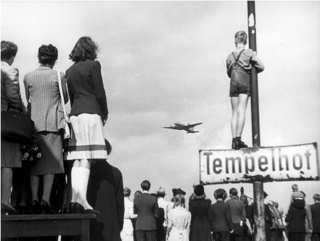
Figure 1. Civilians watching an airlift plane land during the Berlin Blockade, 1948.

Source: Wikimedia: https://commons.wikimedia.org/wiki/File:Germans-airlift-1948.jpg . States Air Force Historical Research Agency; Cees Steijger (1991) A History of the United States Air Force in Europe . ISBN: 1853100757.