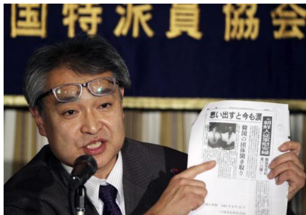
Former Asahi newspaper reporter Uemura Takashi showing the "comfort woman" article from 1991

which he had authored in 1991. The articles are considered to provide key evidences of the Japanese government's involvement in the "comfort women" system. Conservative critics accused Uemura of fabrication. The controversy is still ongoing, and has cost Uemura an academic position. He and his family continue to receive death threats. 2