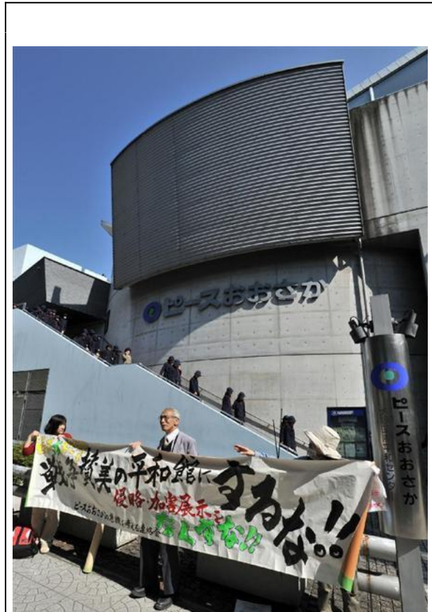
Activists protesting the "renewal" of Peace Osaka, April 30, 2015

The three episodes illustrate ways that memories of the Asia-Pacific War are politicized in line with resurgent nationalism in Japan today. In many of these cases, war memory has become a political position that one must take, polarized between two options: the Asia-Pacific War was a war of imperialism and aggression, or it was a war of self-defense from Western imperialism. How to remember this war has always been a politicized issue in Japan, but the trend has certainly intensified in the last two decades, especially since 1995, the fiftieth anniversary of the war's end. In the cases of the bookstore and the museums, we see instances where the extreme right succeeded in pressuring municipal and private groups to