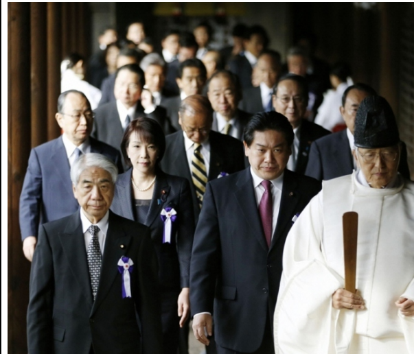
Association of Diet Members Who Jointly Pay Tribute at Yasukuni Shrine (photograph from 2013)

Yet, these apologies were quickly overshadowed by the Japanese government's sharp turn to the political right in succeeding years. As early as 1996, LDP lawmakers tied to conservative lobbyist groups assumed the premiership and other key government positions. 8 These government officials resumed the practice of paying official tribute at Yasukuni Shrine. In 1997, they established the multi-party coalition "Association of Diet Members Who Jointly Pay Tribute at Yasukuni Shrine." These were possible because there was public support for these lawmakers.