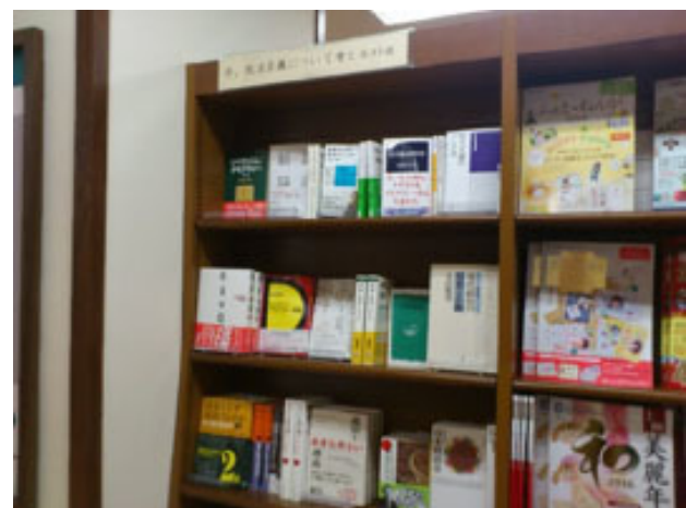
"Fifty Must-Reads for Freedom and Democracy" book fair "Forty-Nine Titles to Think About Democracy Today" book fair