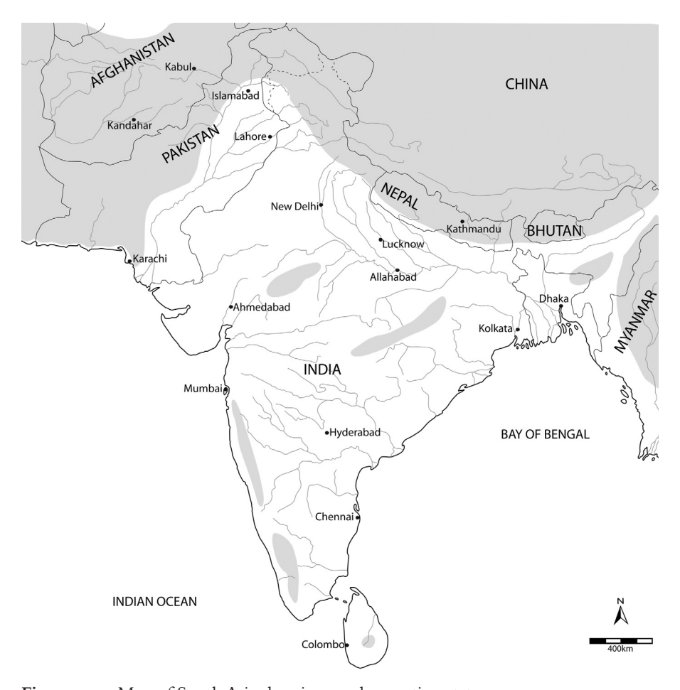
Figure 1.1. Map of South Asia showing modern nation states.

settlements belonging to the period between the two, which has frequently been presented and interpreted as a distinct cultural, political and social transformation. We have chosen to do this for two main reasons. The first is that there were many similarities in the internal sequences and cycles of both these developments and the time lapse between them has now been reduced to a matter of centuries. The second reason is that research now establishes clearly that the origins of both the Indus and the Early Historic urban-focused developments were much older and that both developed far more slowly than has often been presented in the past and, as such, have formed distinct traditions. Within this volume, we will also explore a range of different theories about state formation and social organisation in relation to South Asia, and then test them against a range of archaeological and, where appropriate, historical evidence. This process will serve to demonstrate how much our understanding