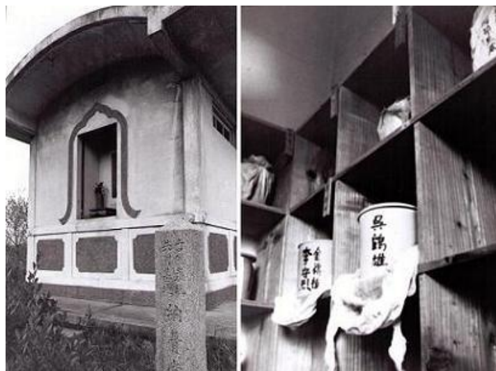
1975 images of the exterior and interior of the Aso Yoshikuma charnel house. Six containers of Korean ashes (right) disappeared the following year.

By 1976, however, all six sets of Korean remains had been removed from the charnel house shelves. Hayashi was shown a small hole beneath the shelves and told by the Buddhist priest in charge that the Korean remains had been deposited in an underground storage area. The unusual funerary practice was not further explained.