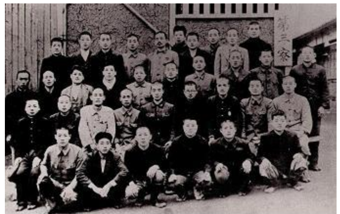
Young Korean labor conscripts at Aso Mining's Atago mine: workers assigned to the Jowa dormitory in 1942 (right) and the Yamato dormitory in 1943.

There were also 300 Allied POWs at the Aso Yoshikuma mine in Fukuoka Prefecture. Documentation includes the Aso Company Report of January 1946 and other records produced by the postwar Japanese government, as described by Japan Focus in May 2007.