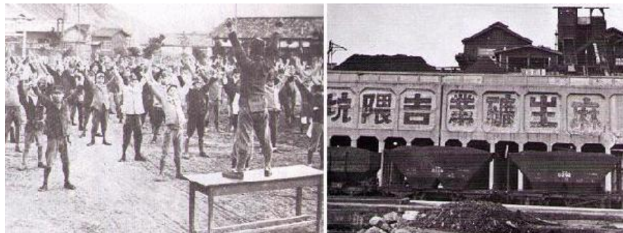
Left: Aso miners doing calisthenics during the war; right: ore cars at the Aso Yoshikuma mine.

“In response to the enemy’s materiel offensive, we will fight by means of increased coal production,” said Kishi Nobusuke, then Japan’s minister of commerce and industry. “All miners must come together in spirit and the patriotic mining industry must dash forward.”