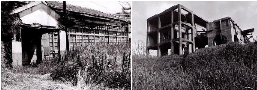
The abandoned Aso Yoshikuma work office (left) and ruined Yoshikuma mine buildings in the late 1970s.