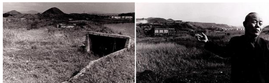
Aso Mining's former Akasaka mine in the late 1970s and a Korean forced to work there during World War II.

"The corporations' survey of remains has been insincere," the South Korean official said. "It is also strange that the family company of the foreign minister, who should be setting an example, has provided no information whatsoever." [2]