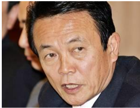
Aso Taro: Japan's future leader?

Japan the Tremendous , a bestseller written in a populist tone, highlights the peaceful nature of postwar Japan and calls the country a "fount of moral lessons" for Asia. Arc of Freedom and Prosperity: Japan's Expanding Diplomatic Horizons expatiates on Aso's tenure as foreign minister from October 2005 to August 2007.