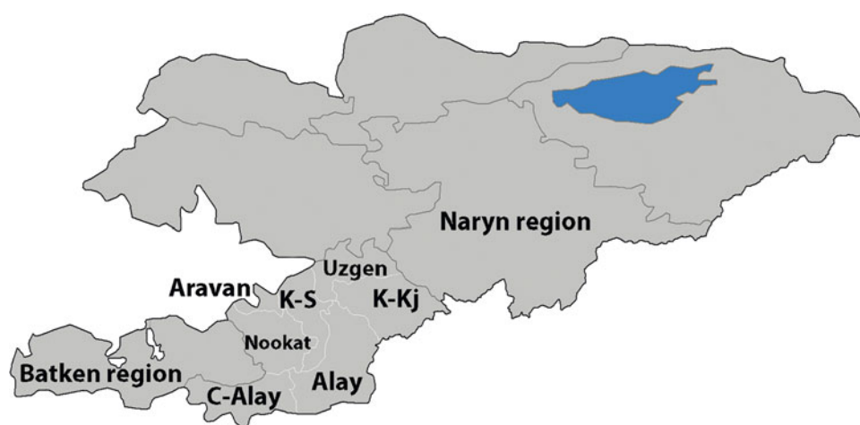
Figure 1. Map of the regions (oblast') and districts (raion) of the Osh region of Kyrgyzstan covered in the study. C-Alay, Chon-Alay; K-Kj, Kara-Kulja; K-S, Kara-Suu. Modified from the original image available at Wikimedia Commons, Created by Rarelibra 3 August 2007.

There was no difference in CE prevalence relative to gender (odds ratio [OR] = 1.13 for men). The age distribution of CE prevalence was relatively even (Table 1), with somewhat higher prevalence at an age over 60 (OR = 1.33, P < 0.05 vs other age groups combined). This profile was compatible with the recent emergence of the epidemic, because elderly subjects did not accumulate exposure over their whole lives proportional to their age. Expectedly, the fraction of post-resection cases was somewhat lower among younger patients, 57% of the total prevalence in