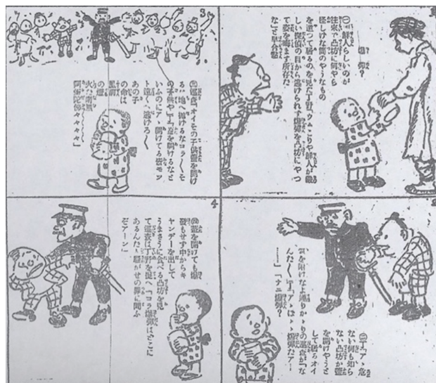
Figure 4: The cartoon “Bomb?” (Bakudan? Jiji Shinpō, October 12, 1920), captures signs of mass panic from the colony migrating to the metropole.

A significant number of images and stories like this one were circulated in the years after the March First Uprising unsettled Korea’s place within imperial Japan. The point is that panic, paranoia, insurrection, and terror associated with the colony and the colonized were very much in the air and in the culture prior to the unforeseen seismic disaster, stimulating the anxious imagination of an empire on the verge of breakdown. The parlance associated with post-disaster unrest and massacres— sawagi , ryūgen higo , bakudan —that seemed to spring from nowhere in 1923, was already firmly established in the discourse and available for repurposing. The same vocabularies and tropes animate and structure both the fantastic stories about Korean sedition that precipitated violent panic (i.e., the rumors), as well as the stories that subsequently reconstructed the experience of the sawagi in testimony, commentary and