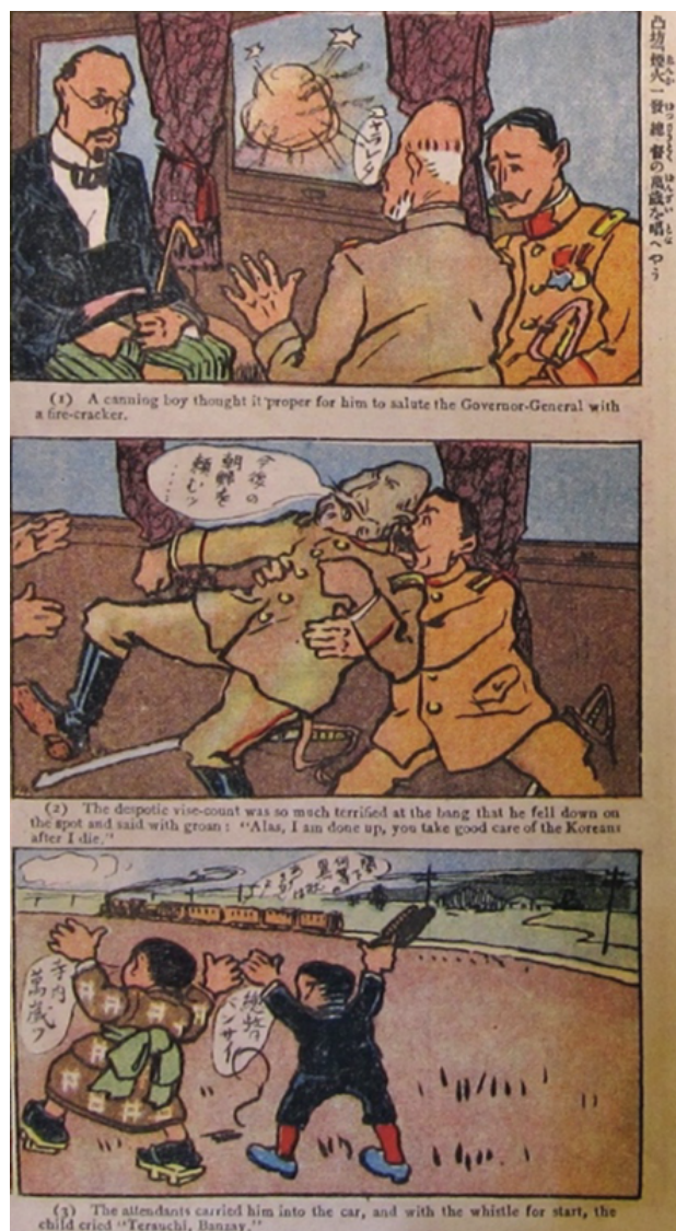
Figure 3: The Osaka Puck comic strip titled “Let’s cheer the Governor-General with a firecracker salute” (Enka ippatsu sōtoku no banzai o tonaeyō, February 15, 1911) portrays the moment that a paranoid Terauchi Masatake experiences a colonial panic attack.

After March First, the imperial insecurities of the sawagi crossed borders, moving from colonized masses to ethnic Japanese officials and settlers, and ultimately to the metropolitan public. Such migrations were mediated through