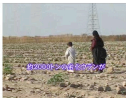
'Approximately 2000 tonnes of DU' -

The documentary showed reports from medical doctors and affected families from 1998 onward of spikes in infant and child leukaemias (acute myeloid leukaemias specific to nuclear radiation) and serious birth defects in Basra and Fallujah, and cases suspected in other locations. They traced the source to depleted uranium munitions (DU) used by US and UK forces in Operation Desert Storm during the first Iraq War (1990–1991). DU is a uranium product derived from enrichment processing of uranium ore, which concentrates the isotope uranium 235 for use in nuclear bombs or nuclear power reactors. The mixture of radioactive waste from this is comprised mostly of U238 (others are Thorium and Proactinium) which has a radioactive half-life of 4.5 billion years. In both the first and second (Operation Enduring Freedom, 2003) Iraq Wars, A-10 Warthog aircraft and armoured ground units (Abrams tanks and Bradley Fighting Vehicles) deployed rounds coated in solid uranium (4,500 grams), which dispersed 300 and 500 tonnes respectively of powderised DU into the local fields and water-ways. 35