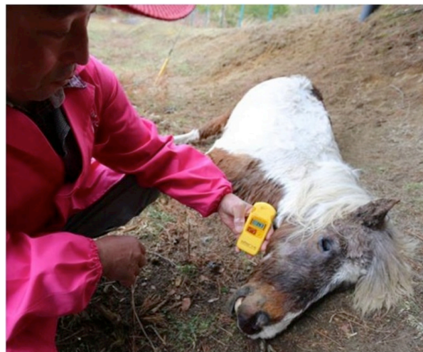
A dead horse at the Hosokawa ranch, 2013

month. 51 4 adult horses also collapsed and eventually perished. The horses were diagnosed with liver failure (lack of red blood cell production). Fieldmice in their 52nd generation since the disaster sampled in early 2012 from a forest 30 km from the NPP1 (Kawauchi-mura forest, Ibaraki-ken) still showed genetic mutations 100 times the control and very high Cs137 levels (3100 bq), as did earthworms, leaves and soil from the same area. 52 People are still growing rice in these areas, and are also returning to them. In early July 2013, moss on the roof of a building in Fukushima city 50kms from the NPP returned extremely high Cs137 concentration (1,785,216 Bq/Kg). 53