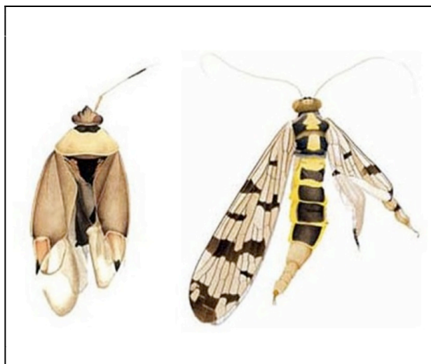
Left: Soft bug (Miridae) from Gösigen, Switzerland ; Right: Scorpion fly (Panorpis communis) from Reuenthal, Switzerland