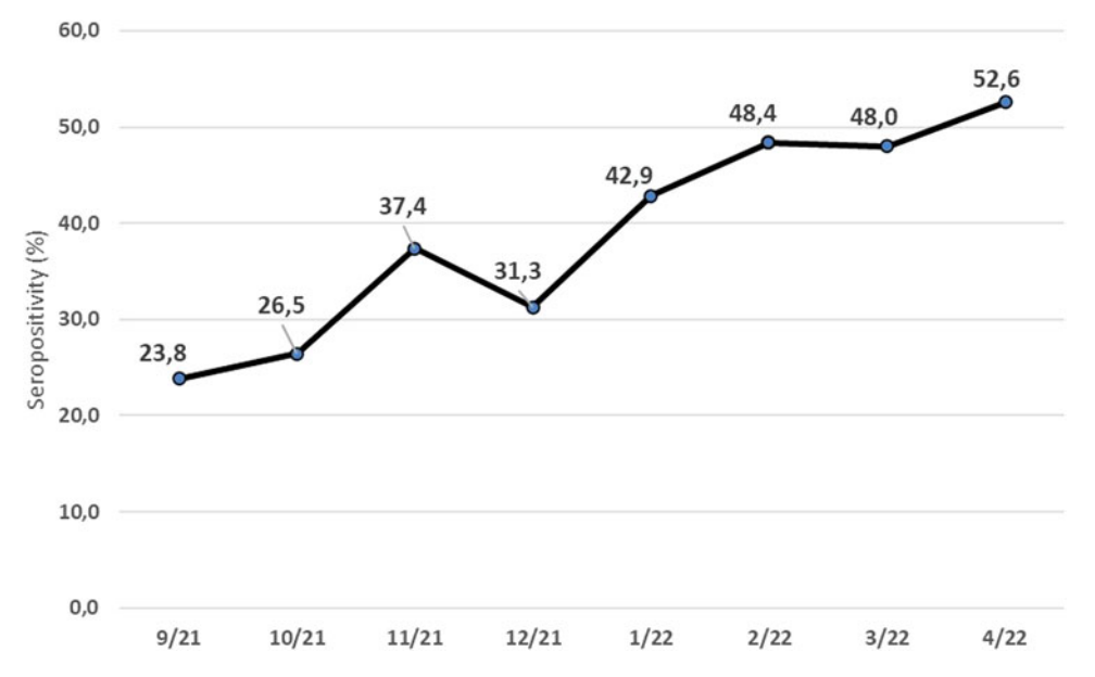
Fig. 1. Seropositivity (%) per month in 1312 children from September 2021 to April 2022 in Athens metropolitan area.

SARS-CoV-2 seropositivity per age group varied significantly ( P -value: 0.017) for each month of the study period (Fig. 2). Regarding seropositivity per month, significant differences were