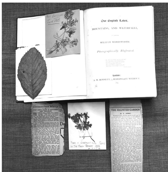
Figure 1 Our English Lakes, Mountains, and Waterfalls, as Seen by William Wordsworth. Photographically Illustrated (London 1864). Cuttings and title page.

head, and we find amid the fading leaves a place for prayer [...] that some of them may come back again—that we may see them with these eyes that have wept so much; see them coming, with kind, living hands held out to us, along the grassy paths of our garden.