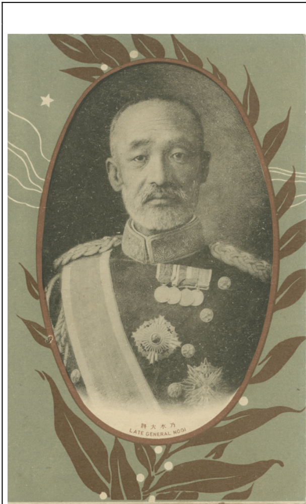
"Late General Nogi," Picture Postcard, East Asian Image Collection, ip0657 [ca. 1912-07-31-ca. 1913-04-13], Special Collections & College Archives, Skillman Library, Lafayette College

of loyalty and sacrifice soon drowned out critical commentary. To justify the profligate waste of life at the core of Nogi's tactics in assaulting the heavily fortified Port Arthur during the Russo-Japanese War, which, at the cost of 15,390 soldiers, was the second most lethal battle of this conflict, the Japanese military further trumpeted "willingness to die" and "service to the nation" as important hallmarks of a glorious military tradition. 34