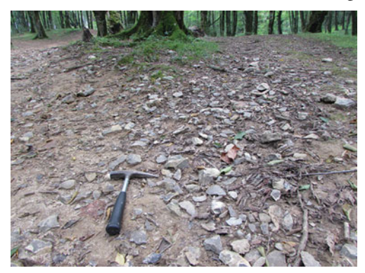
Figure 3. Density of artefacts on the surface.

therefore mainly observable in patches without vegetation, such as on the slopes affected by vehicles' tracks, or in the sections of small gullies created by seasonal rain. Our brief survey