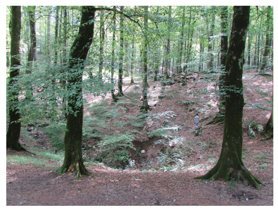
Figure 4. Example of a sinkhole.

considered as components of a single larger site, which has been disturbed by natural and human activities such as erosion and road building. Aside from the close proximity of the