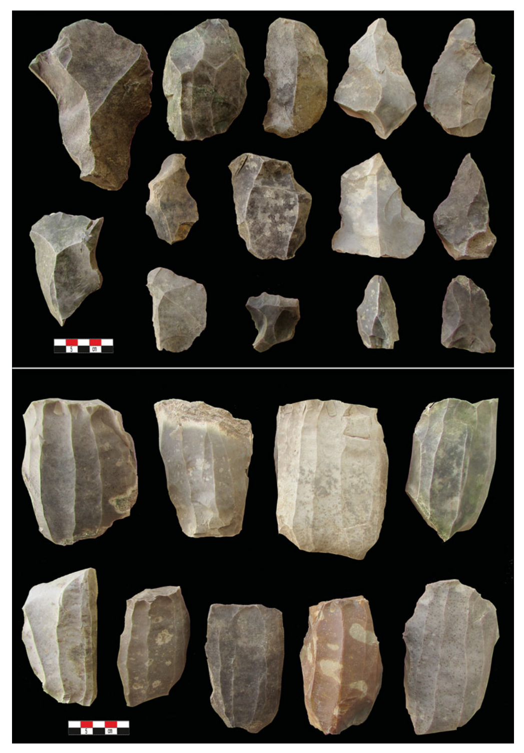
Figure 6. Examples of some of the collected artefacts in Bandepey: top) Levallois pieces; bottom) tongue-shaped blade cores.