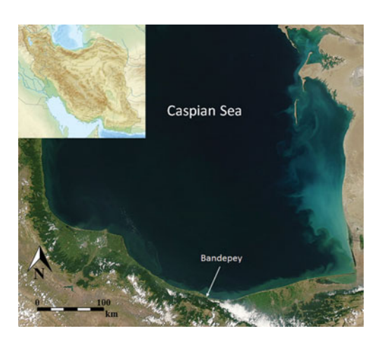
Figure 1. Location of the Bandepey Palaeolithic site near the south coast of the Caspian Sea.

Hamed Vahdati Nasab<sup>1,*</sup>, Kourosh Roustaei<sup>2</sup>, Mohammad Ghamari Fatideh<sup>3</sup>, Fatemeh Shojaeefar<sup>4</sup> & Milad Hashemi Sarvandi<sup>1</sup>