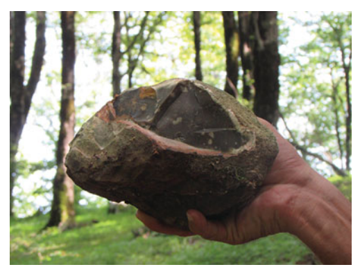
Figure 5. Example of a broken piece of natural rock with silicified parts inside.

considered as components of a single larger site, which has been disturbed by natural and human activities such as erosion and road building. Aside from the close proximity of the