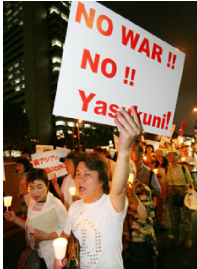
Demonstrators hold candlelight vigil outside Yasukuni, August 11, 2006

Koizumi's visits prompted several Diet members to ask the National Diet Library, which serves as a research organ for the Japanese Diet, to compile material concerning postwar interaction between the Health and Welfare Ministry and Yasukuni Shrine. Among 808 new documents released, 179 had previously been held by the shrine and 94 by the former Health and Welfare Ministry. To better understand the role of the Health and Welfare Ministry, particularly its War Victims' Relief Bureau, in the enshrinement, it is helpful to review the changes in Yasukuni enshrinement procedures made following the Asia-Pacific War.