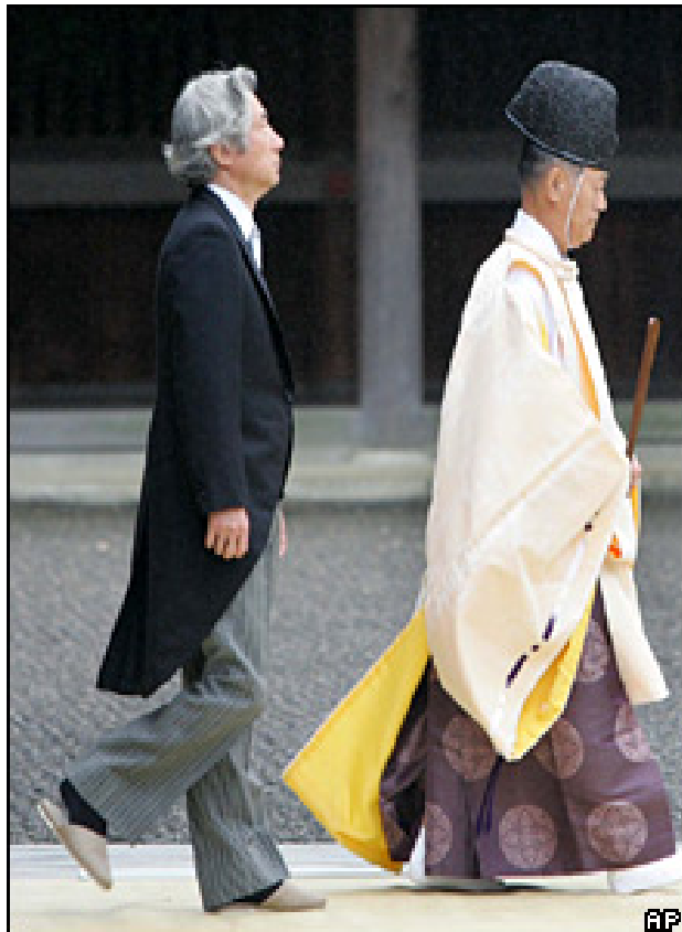
Koizumi visits Yasukuni, August 15, 2006

Between 2002 and 2006, Prime Minister Koizumi Jun'ichiro repeatedly visited the shrine in the face of domestic and international protests, ultimately provoking multiple lawsuits in Japan and severely straining Japan's relations with China and Korea.