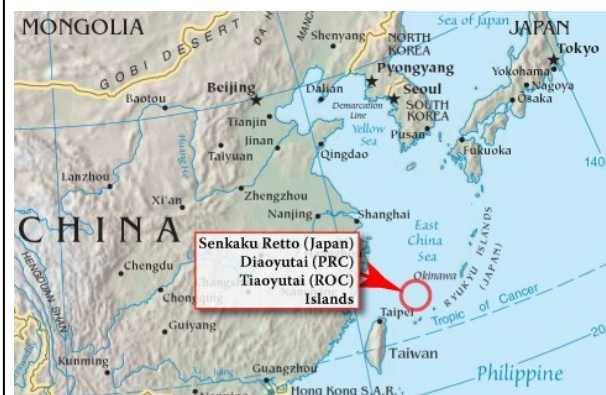
Japan, the People's Republic of China and the Republic of China all claim the Senkaku/Diaoyutai/Tiaoyutai Islands

The war-renouncing provision of the Constitution ensured compliance with the jus ad bellum regime, and indeed Japan has not engaged in a use of force since World War II ( jus ad bellum is the regime of international law that governs the use of force – it essentially prohibits all use of force against other states, with two exceptions, namely the exercise of the right of individual or collective self-defense, and collective security operations authorized by the U.N. Security Council). But with the purported "reinterpretation" and revised laws – which the Prime Minister has said would permit Japan to engage in minesweeping in the Straits of Hormuz or use force to defend disputed islands from foreign "infringements" – Japan has an unstable and ambiguous new domestic law regime that could potentially authorize action that would violate international law.