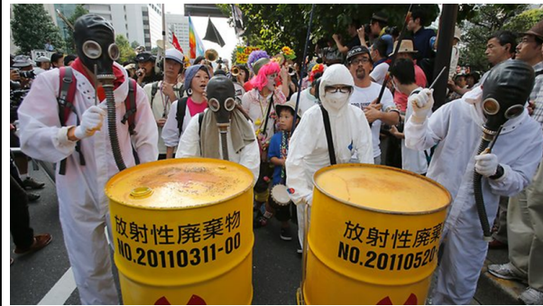
Anti-nuclear protesters, wearing gas-masks, beat metal drums as they march near Japan's Parliament in Tokyo on July 29.

In a series of editorials in the Asahi, Oguma addressed readers more directly. On March 9, 2012, he exhorted his readers to “think for themselves” in deciding whether nuclear power is appropriate for Japan, pointing out the importance of an informed citizenry and the possibility of protest as a viable and even necessary tool of social change, albeit, one that requires more of each individual than they are used to giving. On May 9, 2012, he points to the impossibly high economic and social costs required to somehow minimize or even manage the risk that nuclear power poses to society and humanity. Oguma points to the need for “courage” in facing up to entrenched interests of banks and insurance companies, corporations and bureaucrats, in a Japanese state that is still authoritarian, even in dysfunction.