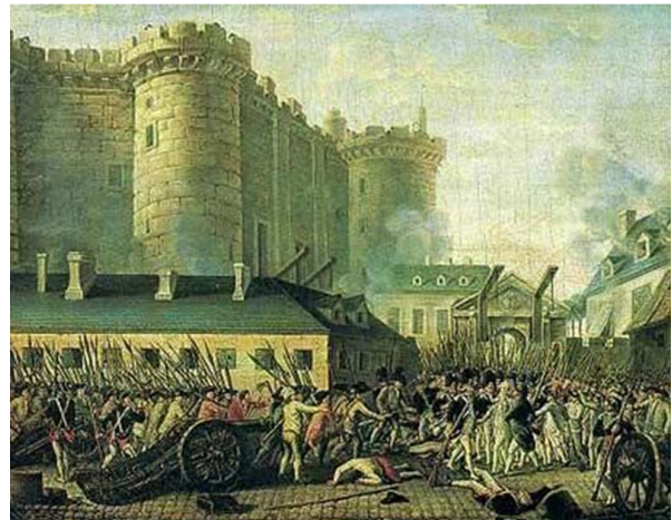
Attacking the Bastille

A: I recalled the diary of Louis XVI during the French Revolution. On the day a mob attacked the Bastille, the king wrote in his diary that nothing happened. Because he went hunting almost daily, the entry meant that he didn't catch anything. There was no recognition that society was being shaken from its very roots.