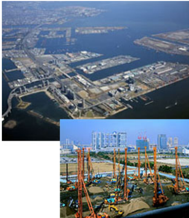
Fudo Tetra's waterfront activities

Tetrapods were designed to remain stable under even the most extreme weather and ocean conditions and when arranged together in lines or piles, they create an interlocking, porous barrier that dissipates the power of waves and currents.