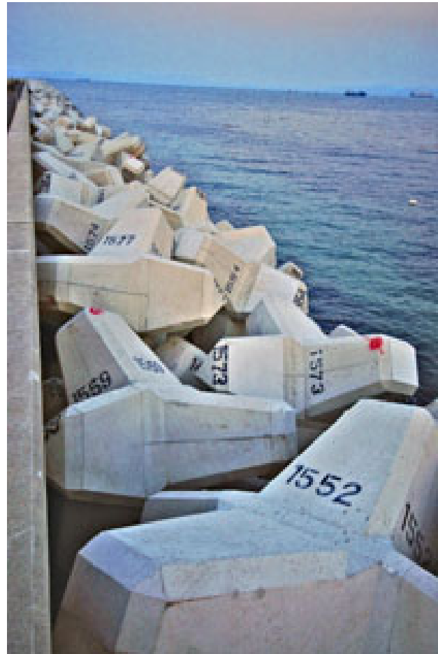
Tetrapods lining the coast at Yokosuka.

Agriculture, Forestry and Fisheries, and of Construction—annually spend 500 billion yen each, sprinkling tetrapods along the coast, like three giants throwing jacks, with the shore as their playing board," he writes.