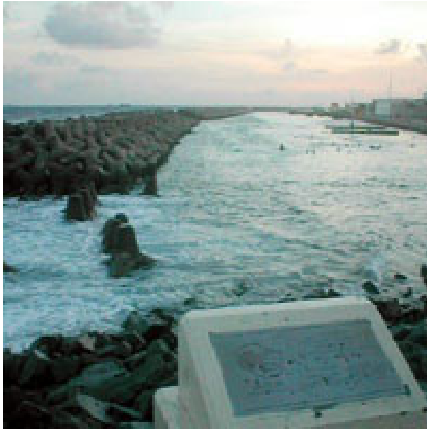
Exporting tetrapods. A tetrapod breakwater offshore at Male, capital of the Maldives. The plaque notes that Overseas Development Aid from Japan provided the tetrapods.

According to experts, coasts worldwide are in flux. “Around the world there are some spectacular examples of the damage caused by retreating shorelines. And there are equally spectacular examples of the expense to which some governments will go to hold their shorelines in place. More than 80 percent of the world’s shorelines are eroding at rates varying from centimetres to metres per year,” write Orrin Pilkey and Terry Hume for a 2001 issue of Water & Atmosphere , in an article entitled, The Shoreline Erosion Problem: Lessons from the Past .