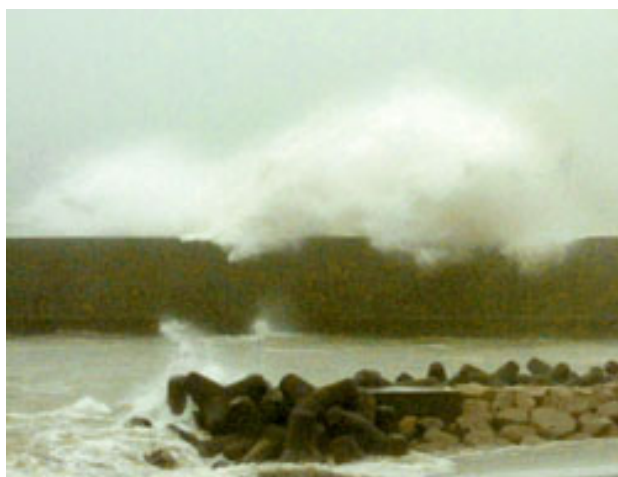
Tetrapods in action during a July typhoon that hit Kyushu.

Tetrapods were designed to remain stable under even the most extreme weather and ocean conditions and when arranged together in lines or piles, they create an interlocking, porous barrier that dissipates the power of waves and currents.