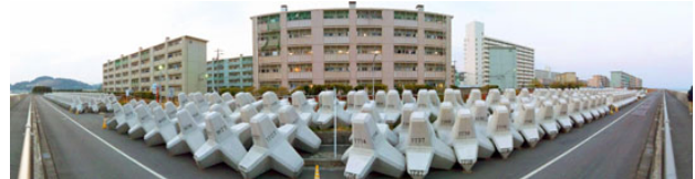
Rooms with a view, Yokosuka, Kanagawa prefecture.

If you live in Japan and have ever visited the coast, then you've probably seen tetrapods, perhaps dozens of them, even if you didn't realize what there were. From Hokkaido to Okinawa, just about anywhere you find a road, a railway, or buildings close by the coast, it's likely you'll also see rows of these large concrete objects piled at the base of cliffs, along the beach, or in the shallows just offshore.