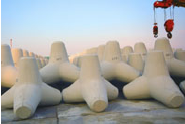
Tetrapods fresh from their molds at Yokosuka set to further denature Japan's coasts

Brittanica.com reports that Japan stretches a total of 2,900 kilometers from north to south, and comprises over 3,900 islands. But Japan's maximum land width is just 320 kilometers, so one can understand why every meter lost might be a meter lamented.