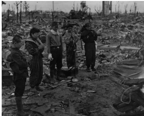
A cremation in the ruins in Nishi-Sugamo, mid-April 1945