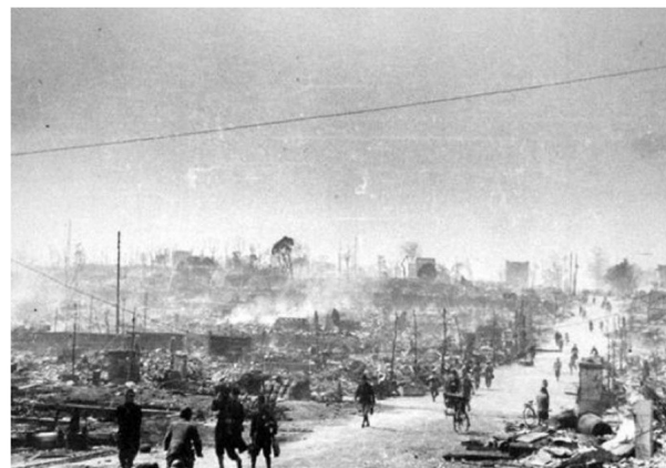
The ruins of Ichigaya in Ushigome ward, April 14

percent. 46 Two months after the end of the war, the Chemical Section of the Twentieth Air Force conducted a survey on the incendiary attacks against Japanese urban industrial areas. To determine the efficacy of Mission No. 67 (Perdition), they visited Tokyo Arsenal No. 1 in Jujo (Target 206). In interviews with Japanese army personnel, they found that only two B-29s had actually bombed the plant and that none of the 500-pound explosive bombs had hit the arsenal installations. Nevertheless, production had fallen by more than 50% after the air raid, partly because about half of the workforce did not return to work. Regarding the area damaged, this was the first US survey to point out, albeit cautiously, that the bombing had been inaccurate: "11.4 square miles was burned over in this attack, but a portion of this damage was in urban areas southeast of the general target area and somewhat short of the selected aiming points." 47 As US documents themselves confirm, this "portion" was much more extensive, accounting for about half of the total area, and the damage "somewhat short" of the aiming points was as far as six miles away.