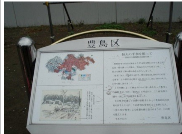
Memorial plaque for the victims of the April 13-14 air raid in Minami-Ikebukuro Park. The map at the top left shows the burned area of Toshima ward in red.

Nezuyama was the local name for a thickly wooded area to the east of Ikebukuro Station. During the war, four large public air raid shelters were built there. On the night of the air raid, hundreds of people fled from the fires to the shelters. The heat of the conflagration around Nezuyama was so intense that whirlwinds raged through the woods. The following morning, the bodies of 531 people who perished in the fires in the surrounding districts were temporarily buried in a field at the southwest corner of the woods. All that remains of Nezuyama is that space, now Minami-Ikebukuro Park, where they hold the memorial service every year.