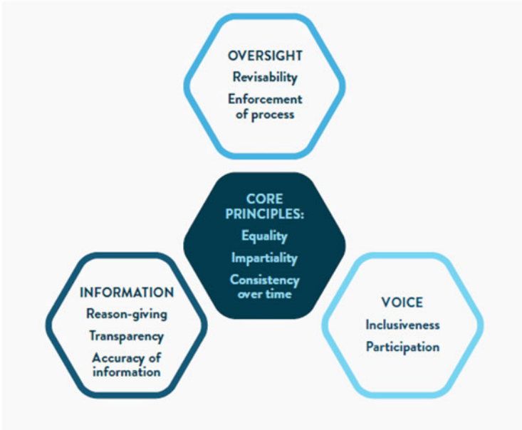
Figure 1. Principles and operational criteria for procedural fairness (World Bank, 2023).

capacity of those not professionally engaged in such work, resulting in elite capture of participatory initiatives by organised interest groups or the more typical stakeholders involved decision-making (Lund and Saito-Jensen, 2013) – in health, such stakeholders include insurance funds, pharmaceutical companies, professional associations, etc.