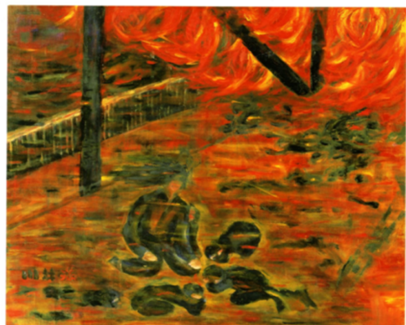
The City Burned Long Ago—As If We Were Vermin

The next day, I led my grandmother through the piles of charcoal corpses and burning rubbish because her eyes were so sore from the heat. We eventually made it to the house of some relatives in Mejiro. It was three days before we were reunited with my father, who had been working the nightshift, and my mother, who had escaped to Ueno after staying behind and attempting to fight the flames.