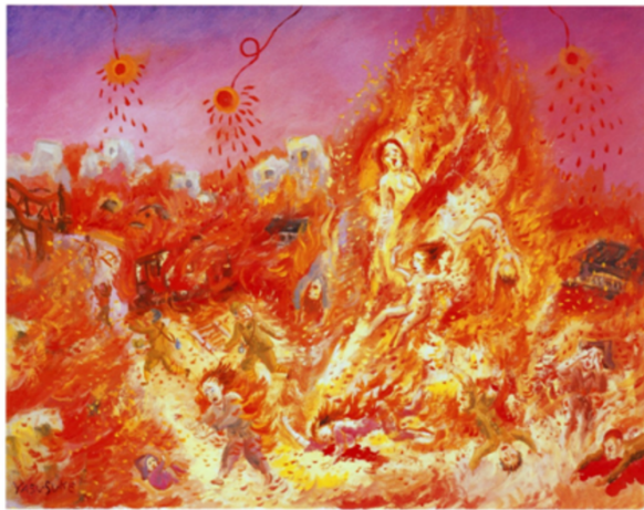
The Umay Bridge on the Night of March 10

I lost six family members that night, but my troubles were only beginning. I was discriminated against for decades as a war orphan and was forced to live at the lowest levels of society. I don't even know who to blame for it. I just pray that those who haven't experienced war will never have to go through that hell themselves.