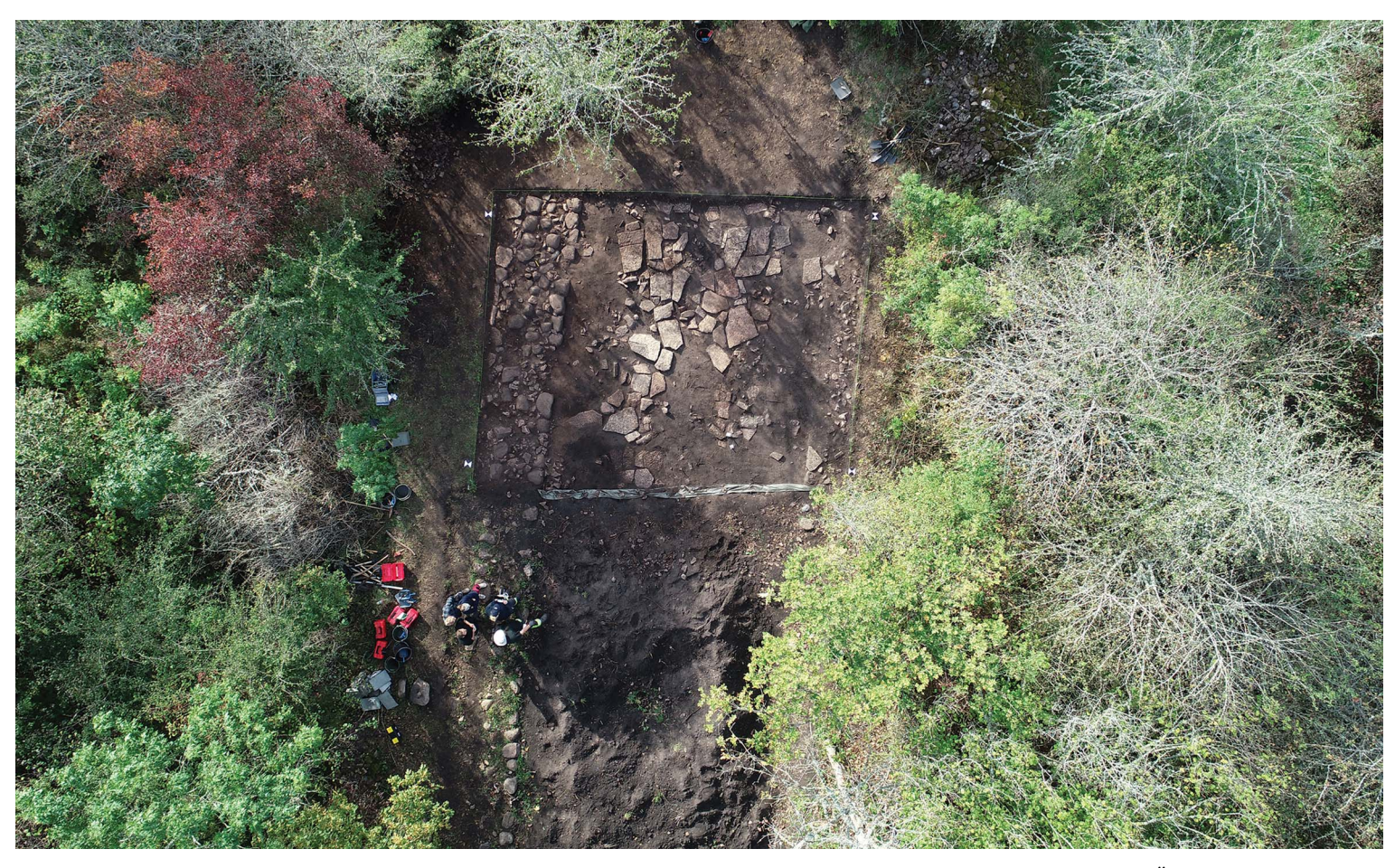
Frontispiece 1. Aerial view of House XI at Gamla Skogsby, Sweden, under excavation in September 2022. The site is located on the Baltic island of Öland, known for its rich and well-preserved Iron Age remains. Sandby borg, located approximately 10km from Gamla Skogsby, has produced evidence of a fifth-century AD massacre, attesting to the use of violence as a political tool during this turbulent period (see Antiquity 92: 421–36). To contextualise the work at Sandby borg, Linnaeus University has conducted excavations since 2019 at the contemporaneous village site of Gamla Skogsby. The findings include well-preserved house foundations and a wealth of animal bone, pottery and other artefacts, which paint a fuller picture of mid-Iron Age society in Migration-period Scandinavia.