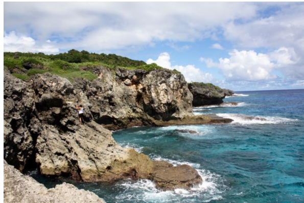
The coastal Pagat archaeological site, Guam's valuable cultural site

Prior to this, relevant congressional committees approved cutting the cost of relocation by 70 percent. With operations not progressing according to US government plan, the plan itself is now being questioned. Committee reports have severely criticised the government, stating: 'Guam's water and waste water facilities, electrical system, roads and other infrastructure are already inadequate. There is no consideration of the environment' (US Senate Appropriations Committee); 'It is a serious concern when and how the DoD will respond to the poor evaluation it received regarding the environmental impact of the Guam construction plan. They have not addressed its impact on residents either' (House Committee on Appropriations).