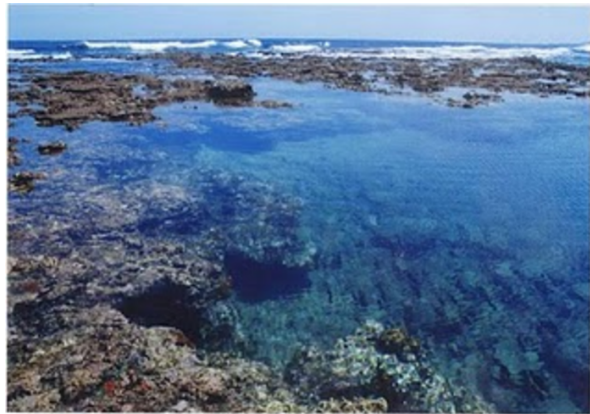
Pristine water off Henoko

As the US faces a financial crisis with no sign of recovery, and a number of difficult related issues, the trend of domestically-oriented policies and national consciousness will continue to accelerate. Even the Republican Party, which believes that a large defense budget is the barometer of state power, and which opposes defense budget cuts, has to accept that there is no such a thing as a 'sacrosanct' sector these days. If the inward-looking philosophy that 'money should be spent only on our own country' spreads further, overseas military forces will undoubtedly become a target to rationalise. Voices calling for 'abolishing overseas forces' have emerged even from within extremely conservative Tea Party groups that influenced recent midterm elections.