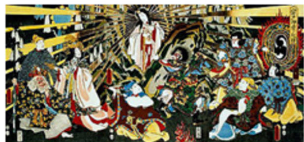
Amaterasu, the sun goddess emerging from a cave to bring light to the universe

Unfortunately, the influence of Nihonjinron on constructing social reality in Japan has often been overlooked by scholars more interested in trampling the ‘bleeding corpse’ (Gill 2001: 577) of a genre of writing that has come to represent something of a straw-man par excellence . As Reader (2003: 111) suggests, the central problem is that critics, perhaps “beguiled by the self-defining rhetoric of uniqueness that pervades nihonjinron”, have come to see such discourses as ‘unique’ to Japan while, at the same time, underestimating the particularities of Japanese culture. In fact, as the following sections illustrate, the opposite is in fact true: Nihonjinron, in the narrow sense of a discourse on national identity, is not unique but the historical materials it draws on and the national culture it helps to (re)create are.