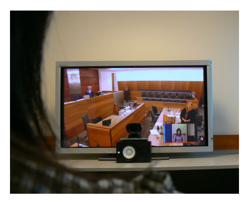
Figure 3 Overview of the courtroom with the image of the judge at the dais.

courtroom and vice versa,<sup>28</sup> as well as ensure that, in the planning stages of a case, documents or exhibits that will need to be shown to a witness giving evidence by video link will be available at the remote end.<sup>29</sup>