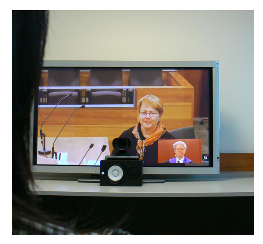
Figure 2 Picture-in-picture close-up of head-and-shoulders shot of the judge within a shot of the bar table.

image of the judge has important implications for two particular aspects of the judicial role: their management of the courtroom and their capacity to embody and project the authority of the court.