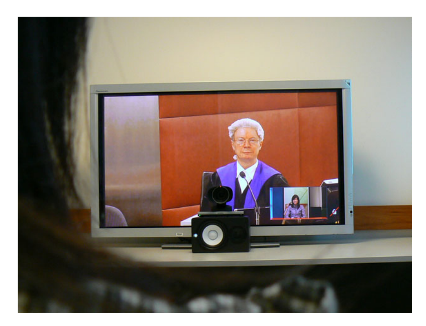
Figure 5 Image of the judge produced by a camera sitting slightly above the judge.

of the evidence that they're giving \dots I think it's important to impress on the person the solemnity of the occasion and the importance of their evidence.<sup>50</sup>