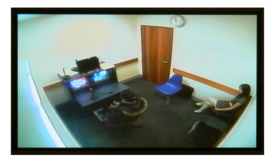
Figure 4 Example of an overview shot of a remote space, captured by a CCTV camera and visible on a separate display at the judge's bench.

questions (see e.g. No. 42 of 2008, s. 41) or when a witness becomes too distressed to continue giving evidence. Making such an assessment can require the exercise of a fine judgment, for example, as to whether a witness appears distressed, is genuinely distressed or whether that distress is the result of having their credibility successfully challenged. It appears from our data that the limitations of communication over a video link can make it harder for the judge to perceive some aspects of the witness's body language that may inform those judgments. For example, a court clerk recalled: