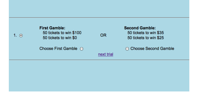
Figure 1: The appearance of one choice trial.

of these lucky people, you will get to play the gamble you chose on the trial selected. You might win as much as $100. Any one of the choices might be the one you get to play, so choose carefully." After each study, prizes were awarded as promised.