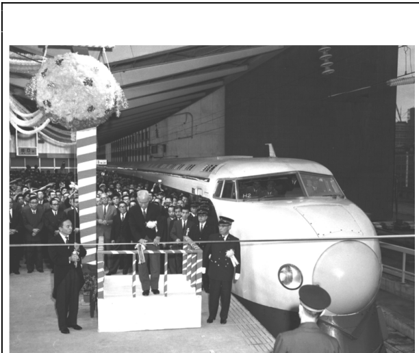
Inaugurating the Shinkansen

New railway lines and national highways were part of the massive pre-Olympic infrastructure program. They offered everyday citizens enhanced mobility throughout the country. Most of all, the Shinkansen (bullet train), which was inaugurated just before the games, not only enhanced transport links between Japan’s major cities, but also reinforced Japan’s credentials as a high-tech powerhouse. After all, the bullet train was the fastest in the world, with a sleek design intended to evoke an airplane (Fujishima 1964: 111).