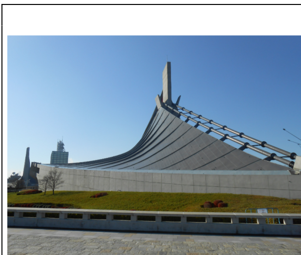
The swimming arena at Tange’s National Gymnasium

needs of a quickly urbanizing and heavily industrializing country. Plans and processes which would usually have been spread out over more than a decade were implemented in less than five years; at the time, the period between selecting the host city and hosting the games was two years shorter than it is today.