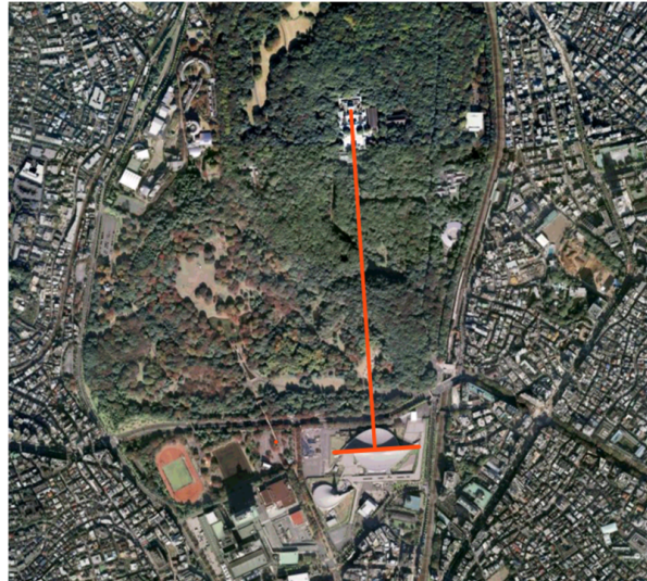
The National Gymnasium and the Meiji Shrine

athletes' village, opposite the shrine's grounds, the architect Tange Kenzo designed his highly acclaimed National Gymnasium. In particular, the swimming arena stood out with its boldly curved roof and concrete structure.