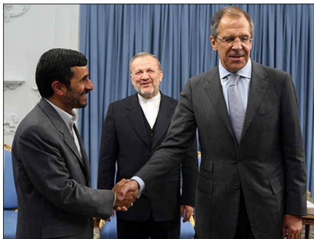
Iranian Prime Minister Mahmoud Ahmadinejad (left) shakes hands with Sergei Lavrov as Manouchehr Mottaki looks on

Foreign ministers are busy people - especially energetic, creative diplomats like Russia's Sergei Lavrov and Iran's Manouchehr Mottaki, representing capitals that by tradition place great store on international diplomacy.