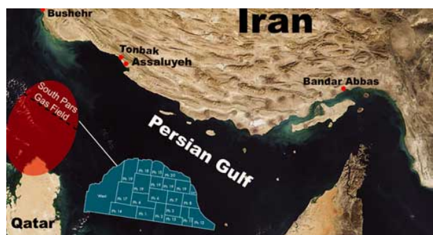
The South Pars Field

Russia's number one priority in energy cooperation with Iran will be for upstream participation by Russian companies. Gazprom has had some limited participation so far in the early phases of Iran's massive South Pars gas fields with an estimated aggregate cumulative production range of a stunning 13 trillion cubic meters. Moscow will be keen to promote greater involvement. Gazprom has shown interest in the Iran-Pakistan-India pipeline project not only as a contractor but also as an investor.