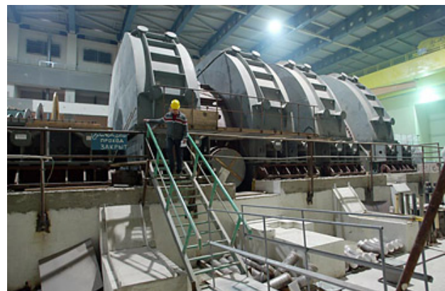
The Bushehr nuclear power plant