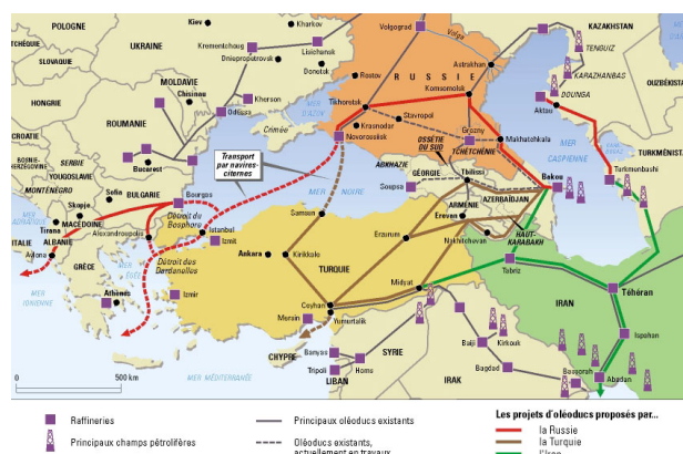
Caspian oil and gas pipelines and projected lines

agreement relating to the Caspian littoral pipeline on December 12 with his Kazakh and Turkmen counterparts, the curtain came down on one of the grimmest struggles of the great game in the post-Soviet era. Moscow came out the winner by far, reasserting its pre-eminent position in the Caspian.