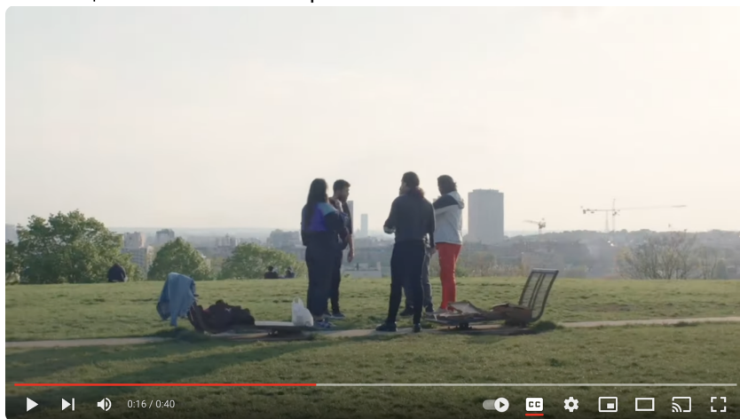
World Refugee Day 2022 – IKEA