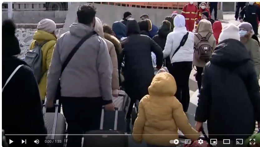
We Are ONE | Manifest for the Ukrainian People