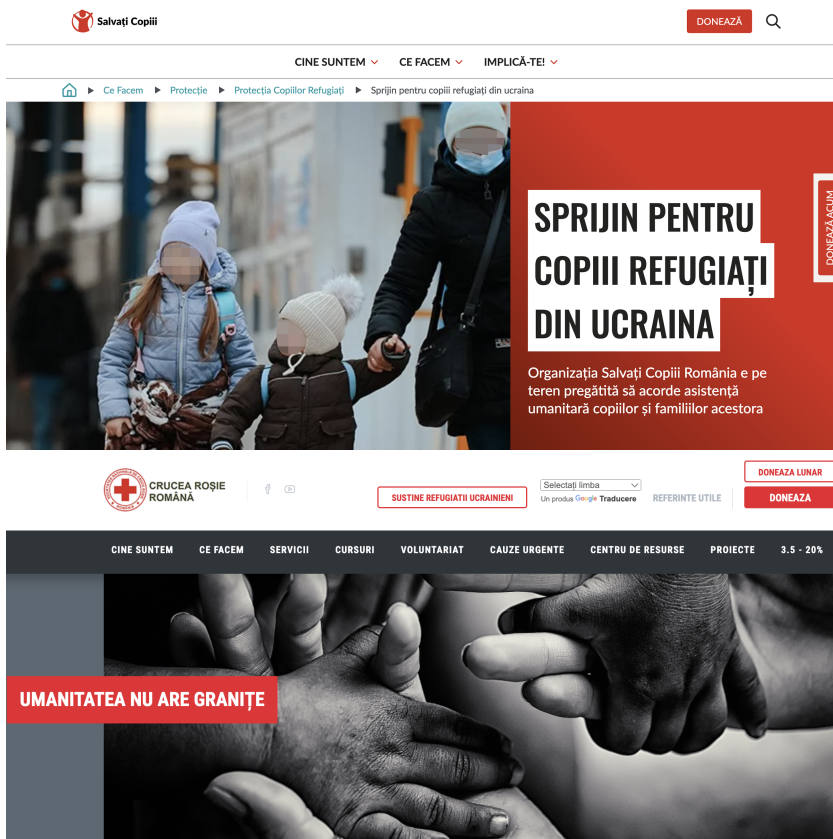
Figure 2. Visuals used to represent Ukrainian refugees on NGOs' crowdsourcing platforms; top , Save the Children Romania; bottom , Romanian Red Cross.

We have discerned two mechanisms employed by actors to establish themselves as owners of the crowdsourcing initiatives: managing visibility and educating