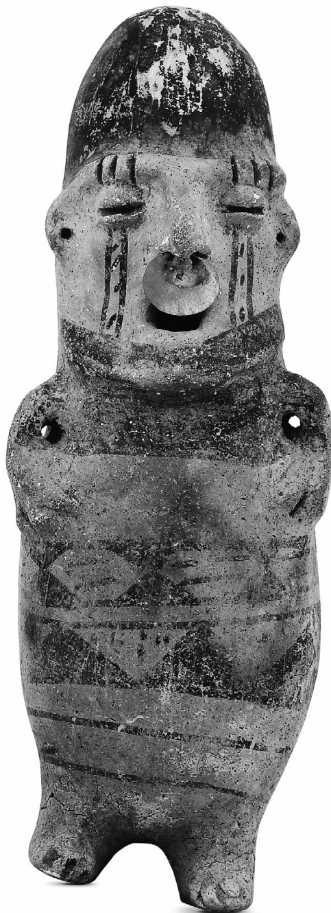
FIGURE 1.3 Ceramic figure with facial decoration and gold alloy nose ring ( santuario? ), Colombia, Eastern Cordillera, 800–1600 CE (Muisca period). Note the geometric design painted on the body of the figure, likely depicting a painted manta. Private collection.