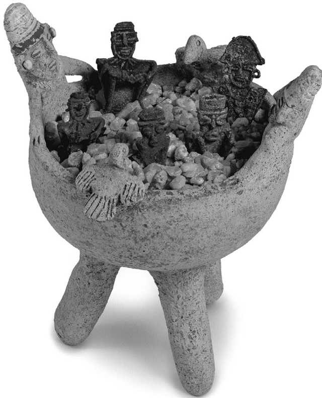
FIGURE 1.4 Tripod offering bowl with human and bird guardians, containing votive figures ( tunjos ) and emeralds, Colombia, Eastern Cordillera, 800–1600 CE (Muisca period). Los Angeles County Museum of Art, the Muñoz Kramer Collection, gift of Camilla Chandler Frost and Stephen and Claudia Muñoz-Kramer.

rag and wrapped cotton, all smoked', that was probably the object of all of these offerings. 163