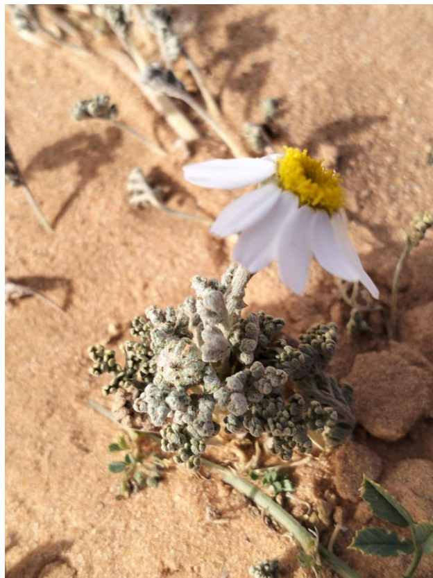
Habit and flower of Anthemis stiparum subsp. sabulicola (Pomel) Oberpr.

Further botanical surveys are required in this area, to facilitate assessment of A. stiparum subsp. sabulicola for the IUCN Red List and to support official protection of the area.