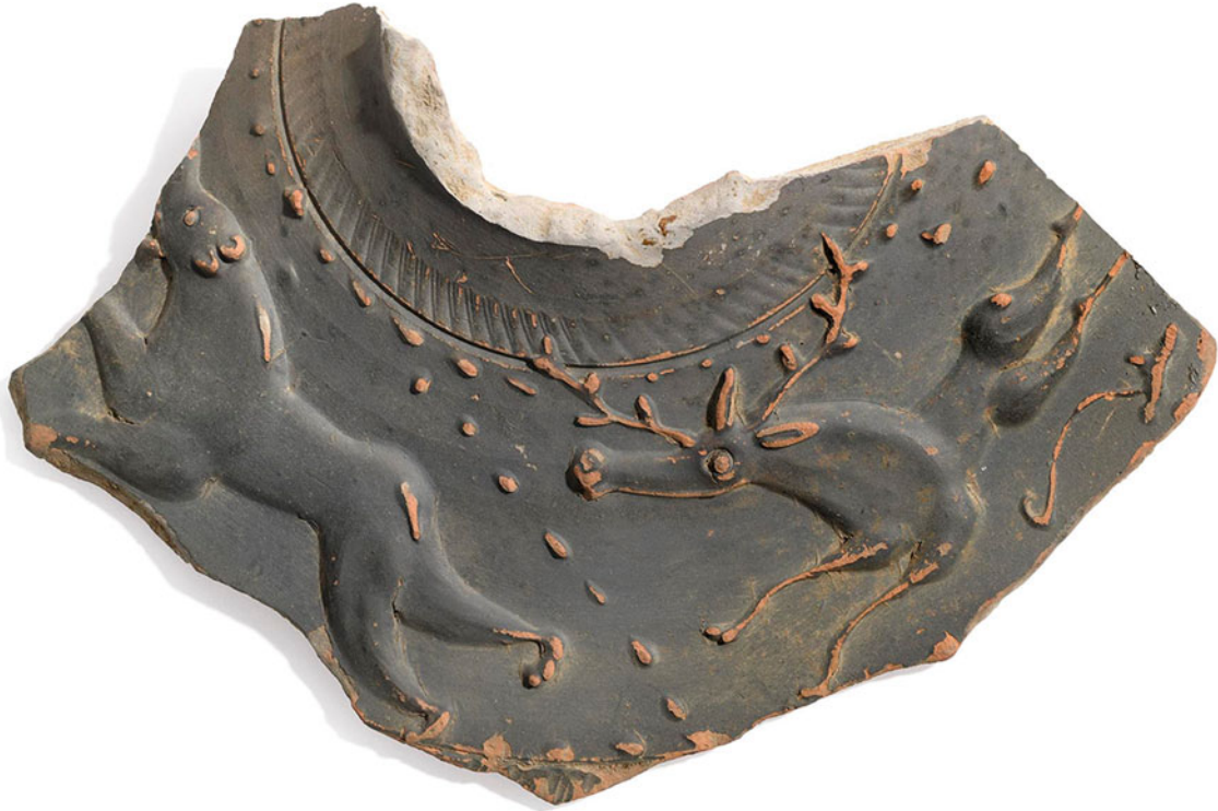
FIG. 8. A bear and stag on the lid of a Colchester colour-coated ware bowl. Not to scale.