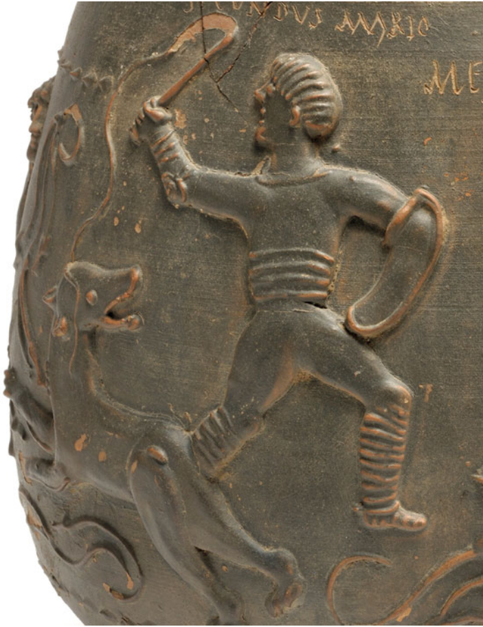
FIG. 4. Fissures on the body of the man whipping the bear. Not to scale.

decoration. This effect is found on other decorated beakers made c. A.D. 160–200 at the Oaks Drive kilns in Colchester. 17