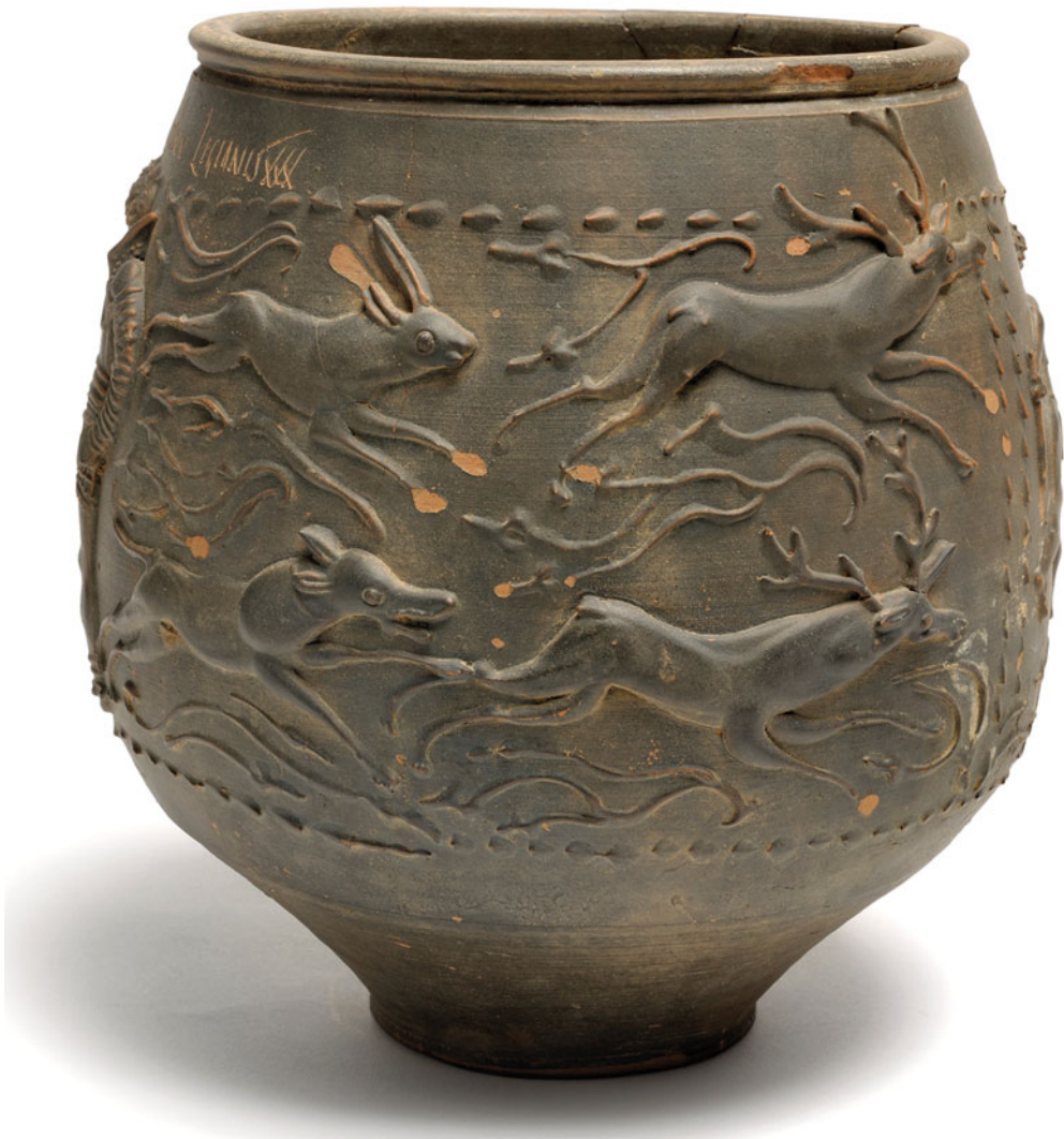
FIG. 10. Colchester Vase, Scene 3. Not to scale (height 212 mm).

floor of a barracks, and another, from Zugmantel, Germany, was found in a deposit with 55 coins, the latest being of Commodus and Crispina (A.D. 177–92/178–91). 48