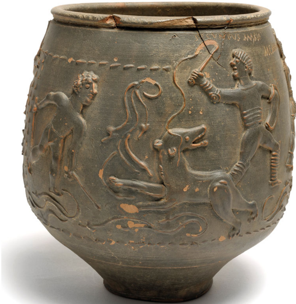
FIG. 6. Colchester Vase, Scene 1. Not to scale (height 212 mm). (Photo D. Atfield; © Colchester Museums)

rather than of a full-scale venatio ending in the deaths of beasts and men, 37 and they may have had a long working relationship with each other and with the bear. A curly-haired man, very like the figure on the left but with only one stick, is on another Colchester colour-coated ware beaker, where he is shown driving children or dwarfs dressed as genii cucullati towards a dog (FIG. 7, left). 38 Another curly-haired man whipping a bear is on the same beaker; he has