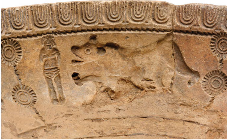
FIG. 11. Potter A mould fragment for a Colchester samian bowl, showing a bear attacking a damnatus/noxius (accession number COLEM:1957.22). In Hull 1963 (fig. 20, 2) the drawing reverses the image to show the end product. Not to scale.

in style to that on the Vase, also attacking a damnatus/noxius (FIG. 11). 70 Barbotine wares made at Cologne also show some links with Colchester. The Cologne potters usually featured animal hunts, but they did occasionally make pots with figures wearing similar padding and armour to those on the Vase. 71 The forms also provide parallels: both centres produced large beakers like the Vase during the second century, 72 and both made the form of lidded bowl known as the ‘Castor box’ and decorated it with barbotine. 73