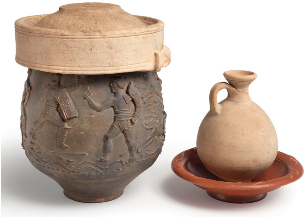
FIG. 3. The grave group: Taylor Collection Grave 14/13, Colchester Museum Accession number COLEM: PC.727–730. Not to scale (Vase height 212 mm).