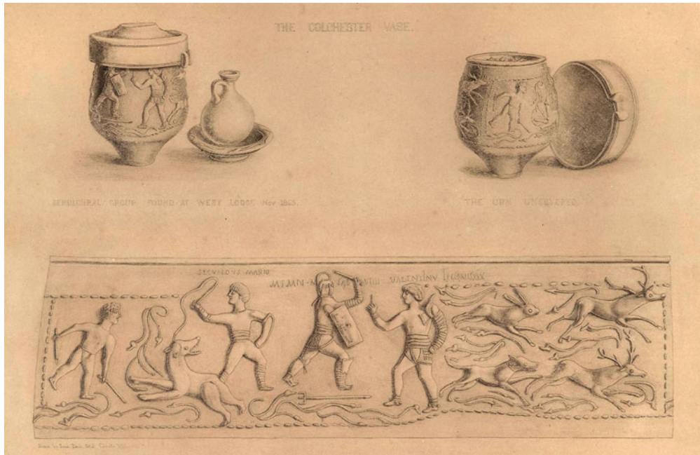
FIG. 2. The grave group and the scenes on the Vase, drawn by the artist and archaeologist Josiah Parish (1834–82) soon after excavation. Not to scale.