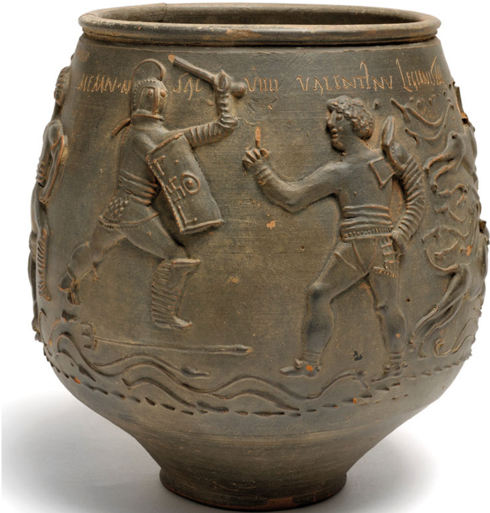
FIG. 9. Colchester Vase, Scene 2. Not to scale (height 212 mm).

rectangular shield is smooth at top and bottom but has small bosses running down the side. There are extended L-shaped ridges at each corner of the shield, and a central boss. Between the boss and the side is a raised right-facing (propitious) swastika or gammadion , a motif also seen on late second- to third-century brooches, with excavated examples generally coming from military sites from Hadrian's Wall to Dura-Europos in Syria. 47 One from Chester was found on the