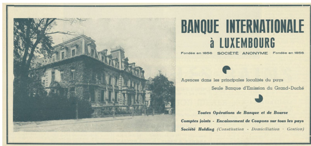
Figure 2. Touring Club Luxembourgeois 1936, Luxembourg, Imprimerie P. Linden, 1936, 109.