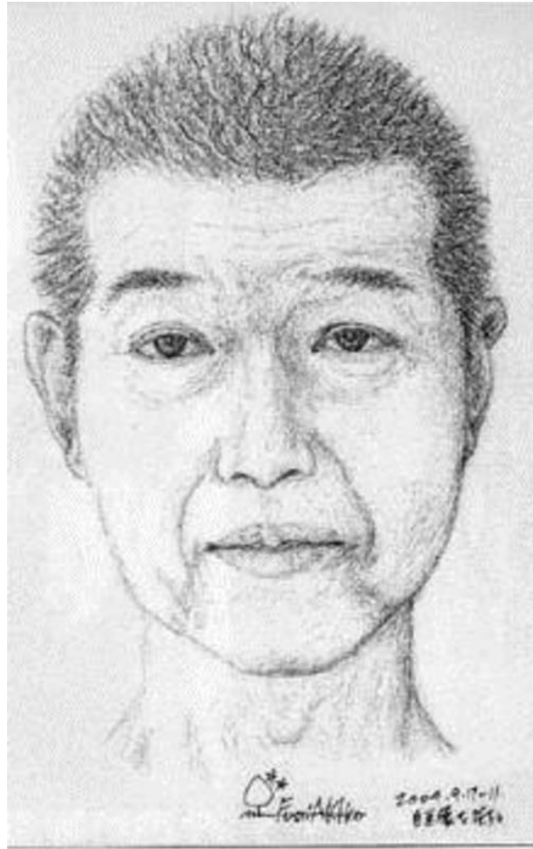
Sketch of Hoshima

conditions in Tokushima Prison, where there is no heating or air-conditioning.