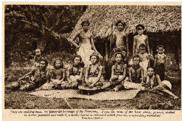
A staged performance of kava making, including elements of documentary, portraiture and ethnographic imaging, this was often published; see New World of Today , Volume 8, p.165; and as a photogravure, see, People of all nations , Volume 6, p.4402.

The four other photographs of Samoa in The