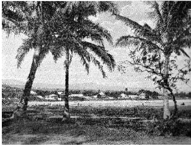
"Apia, Samoa"; the second illustration under Samoa in World of Today , Vol 4, 1907, p. 183.

narratives, it seems editors and readers were comfortable with this manner of knowing Samoa.