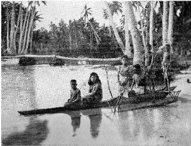
"Natives and canoe, Savai'i", under "Samoa" in The World of Today , Volume 4, 1907, p. 187.