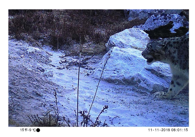
PLATE 1 Snow leopard photo-trapped in Gaurishankar Conservation Area (Fig. 1).

photographs of a snow leopard, the first photographic evidence of the presence of the snow leopard in Lapchi Village and the Lamabagar corridor (Plate 1). Whether this snow leopard was a seasonal visitor or has a permanent home range in the area will require further study. The camera that captured the snow leopard recorded four other mammalian species: musk deer, blue sheep, red fox Vulpes vulpes and bobak marmot Marmota bobak .