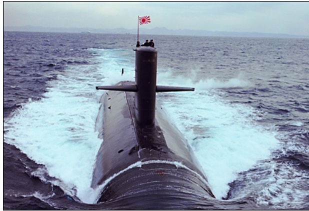
The Takeshio, one of Japan's 3 Yushio class of submarines, and part of a fleet of 16 submarines

Russia views the deployment of similar BMD systems in Eastern Europe. It is often argued that BMD systems are not purely defensive, as they increase the vulnerability of those states whose deterrence power is thereby undermined.