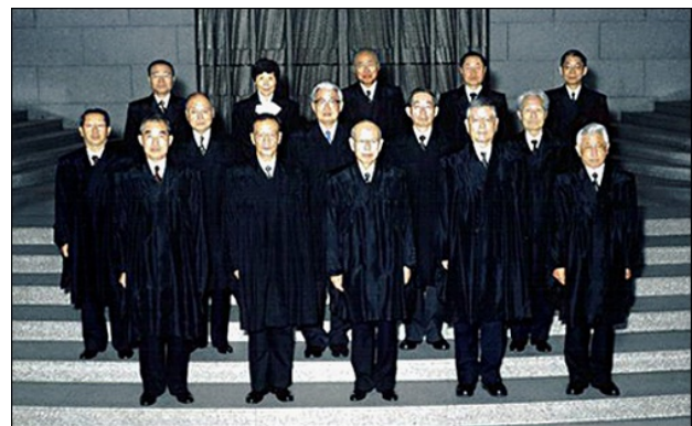
Justices of the Supreme Court of Japan, those with the constitutional authority to interpret the Constitution

judicial review generally was limited to ex post facto consideration of concrete cases, in the American tradition, as opposed to permitting requests, either by private litigants or the government, for determination of hypothetical questions on the constitutionality of prospective events.[14] Thus, the government cannot refer the question of whether, for example, a government policy permitting the deployment of Maritime Self Defense Force (MSDF) ships in defense of US vessels in international waters would violate Article 9, as would be possible in Germany or Canada, to name just a couple of constitutional democracies with a system that permits constitutional references.