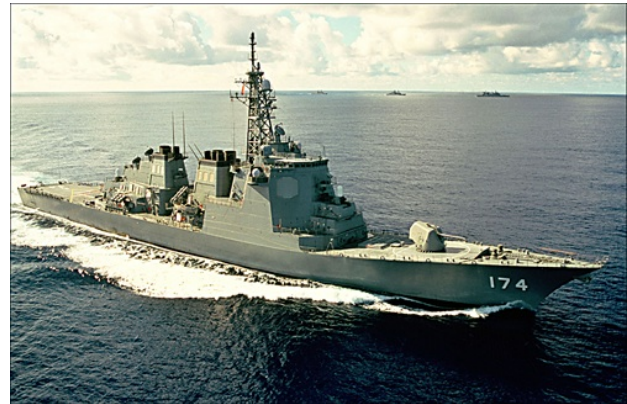
The Kirishima, one of Japan's 4 Kongo Class Aegis guided-missile-system destroyers, and part of a fleet of 44 destroyers

This interpretation leads, of course, to all kinds of tortured arguments over what constitutes defensive weapons as opposed to offensive weapons, what exactly “war potential” means, and when defensive weapons systems might cross the line to become war potential.[21] But putting aside questions of whether, for instance, Japan’s Kongo Class Aegis guided-missile-system destroyers and its fleet of 16 submarines constitute offensive weapons, this is and has long been the accepted interpretation in Japan. It was departed from with the passage of legislation in 1992 to permit support activities in UN peace keeping missions, and to deploy support forces for the Afghanistan and Iraq campaigns, but the prohibition against collective self-defense remains the prevailing understanding of Article 9.[22] Thus, while Japanese SDF troops were deployed to Iraq under special legislation for “support” purposes, the troops were classified as “non-combat” and operated under strict self-defense rules of engagement, to the point that they were under the “protection” of the Australian forces.[23]