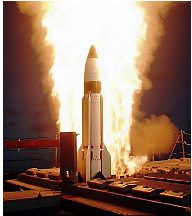
The ship-based launching of an SM-3 Missile, similar to those to be deployed as part of a joint US-Japanese BMD system

defense of the United States.[12] The “re-interpretation” being sought is in part designed to legitimize a BMD system already agreed upon and currently under development.