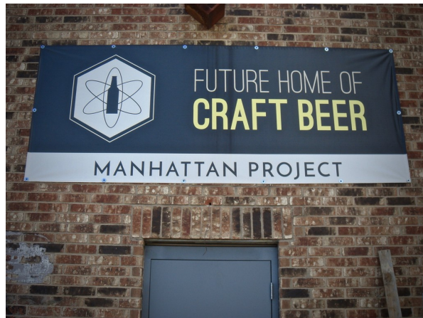
Banner outside the Manhattan Project Beer Company, a brewery operating in a warehouse space in Dallas, Texas. A taproom is coming soon.

Pacific Islanders are speaking out after a Texas-based company, the Manhattan Project Beer Co, named one of its handcrafted beers, Bikini Atoll. Based on news coverage and responses on social media, people around the world are listening. An online petition asks CEO Jeff Bezos and other distributors to stop selling Bikini Atoll. It currently has 6,000 signatures. On Aug. 15, the Marshall Islands National Nuclear Commission (NNC) released an official statement calling on the Manhattan Project “to engage in dialogue with the people of Bikini to hear directly from community members about their reactions to their product.”