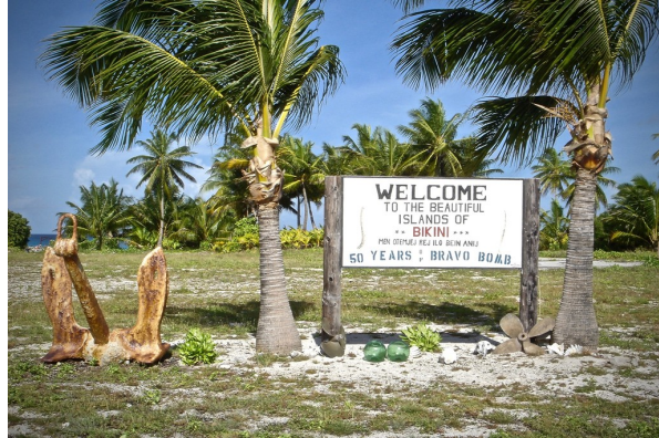
Sign on Bikini Atoll, “Welcome to the Beautiful Islands of Bikini.”

On the webpage “Our Story,” the company explains how it arrived at its peculiar nomenclature: “The group decided to formalize under the name Manhattan Project, given our creative, collaborative, experimental, and scientific approach to beer making (not to mention the plethora of cool beer names like Half-Life and Superfortress).”