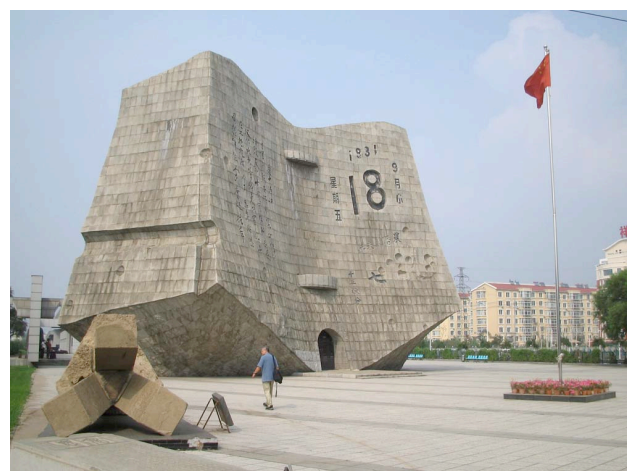
Stone calendar statue in the courtyard of the September 18 History Museum

It is situated outside the central core of the city on the site of the explosion that was used by the Japanese as a pretext for attacking Shenyang and eventually occupying all of Manchuria. Unlike the Unit 731 Museum, however, the museum’s symbolic power does not derive particularly from the historical site. Instead, the building’s design and the use of external space immediately around the museum give it power. What first catches one’s eye as one enters the main gate is the giant stone calendar, riddled with bullet and bomb holes and opened to the date September 18, 1931.