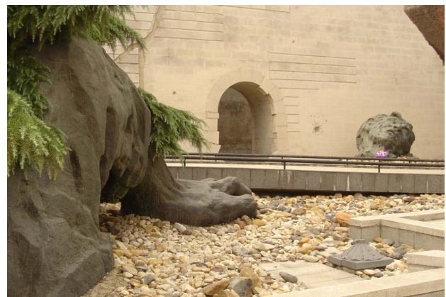
“Disaster in the Ancient City,” a sculpture at the end of the entrance courtyard in the Nanjing Massacre memorial

The memorial is constructed on the site of a mass grave of victims that was unearthed in the early 1980s. It consists of three main sections: the L-shaped entranceway, the graveyard grounds, and the history exhibit. As you enter the square, a long courtyard leads to the site’s most impressive work of art, “Disaster in the Ancient City” ( Gucheng de zainan ). In the background is an ancient city wall riddled with holes (as if from bullets and bombs). In the foreground is the half-buried body of a victim, his head severed from the rest of his body, of which only an arm and hand are visible.