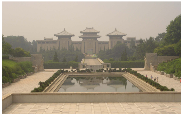
Main hall at Yuhuatai Martyrs Park in Nanjing