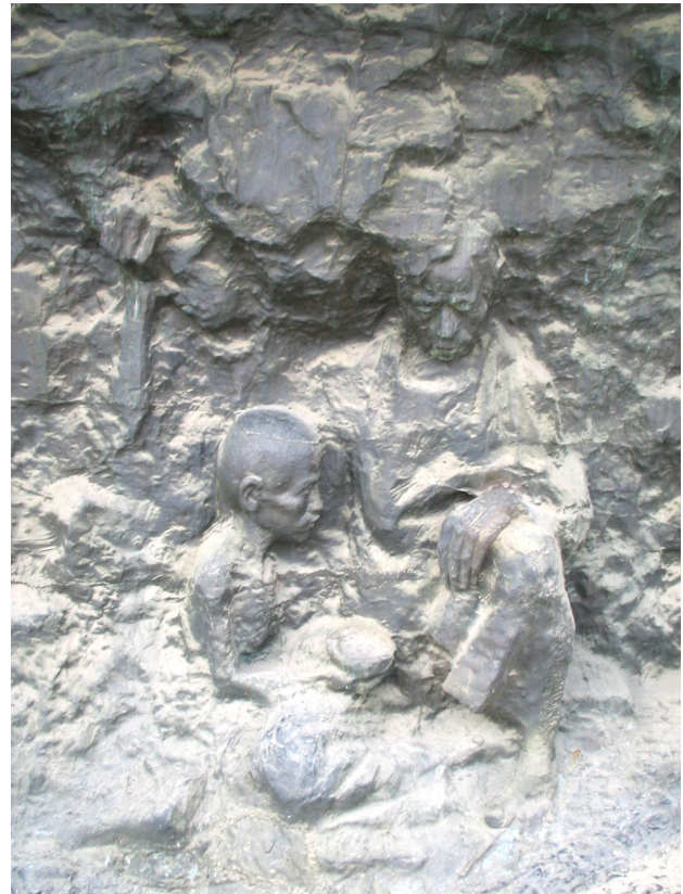
Close-up of relief on the front exterior walls of the September 18 History Museum

Indeed, from a distance, the movement of the relief along the wall does suggest sweeping dark brush strokes on white paper. Only close to the relief can one notice figures of suffering victims of the Japanese attack embedded in the bronze.