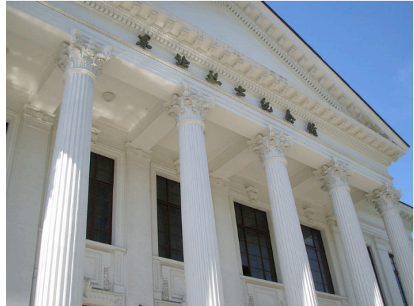
Front façade of the Northeast Martyrs Memorial Hall

Typical of Maoist museum and memorial representations of the war is the Northeast Martyrs Memorial Hall.