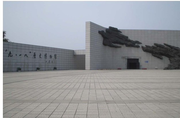
Main exhibition hall of the September 18 History Museum

The museum building is among the more interesting architectural designs of new museums in the PRC.