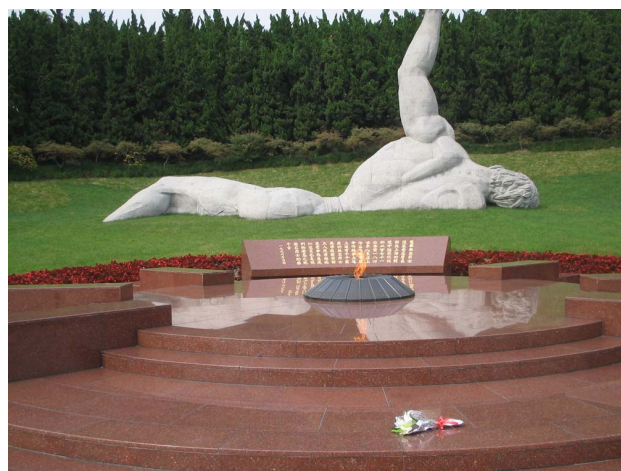
Unknown soldier statue, Longhua Martyrs Park, Shanghai