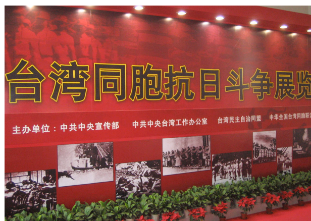
Sign at the entranceway of the Anti-Japanese Resistance Struggle of Our Taiwan Compatriots exhibit, held at the National Museum of China in 2005

common memory of resistance to Japan has been used to forge historical links between Taiwan, Hong Kong, and the mainland and thereby draw attention to their shared identity and political destiny. In the fall of 2005, the National Museum of China put on the much-publicized Exhibition on the Anti-Japanese Resistance Struggle of Our Taiwan Compatriots ( Taiwan tongbao kangri douzheng zhanlan ) (fig. 1), and the place of Taiwan resistance is much more prominent in the 2005 renovated exhibit at the War of Resistance Memorial Hall than it was in the museum’s previous exhibit.