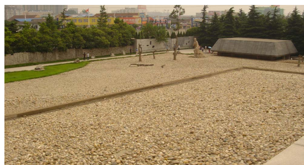
Graveyard grounds at the Nanjing Massacre memorial

Zen garden aesthetic to the graveyard. One cannot see the graveyard from the entrance square; it must be entered by first mounting some stairs, above which is a sign that reads “300,000 Victims,” and walking through an elbow-shaped passageway formed by cinderblock walls to each side. At the end of the enclosed passageway, a vista slowly opens up to reveal a landscape of scorched pebbles interrupted only by a few leafless trees and the statue of a mother who appears to be searching for her child.[47] Along the edge of the field of stones, the visitor follows a long stone relief, which forms a barrier between the graveyard and the outside world, depicting moments of horror suffered by Nanjing residents during the massacre. After passing by a memorial wall (labeled “The Crying Wall”) inscribed with the names of victims, the path then leads through two separate “bones” rooms—exhibits of actual bones of massacred victims found at the site.