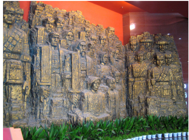
Bas relief in the entrance hall of the War of Resistance Museum

Significantly, the memorial hall commemorates not the victims of the Nanjing Massacre or other atrocities but the heroic fighters against Japanese imperialism. The museum concludes not with the victims of atrocities but with a conventional reverence for the heroes of national resistance. It opens with a similarly heroic and threatening image: a massive bronze relief of soldiers and others who resisted Japanese aggression tellingly titled Build Our New Great Wall with Our Flesh and Blood ( Ba women de xue rou zhucheng women xinde changcheng ), a line from the Chinese national anthem.