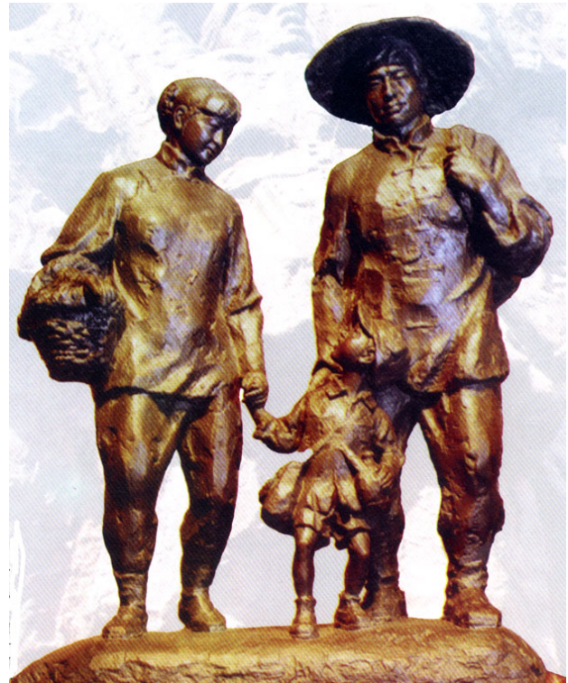
"The Monument to the Chinese Foster Parents," a sculpture near the end of the basic exhibition in the September 18 History Museum

Among the more powerful dioramas in the museum is one of life-size wax figures of Japanese war criminals being tried in a Shenyang court in 1956. The twenty-eight wax figures are dressed in black, and their heads are bowed in recognition of their guilt; behind them is a collage of photographic images of Chinese victims of the war with soaring planes, exploding bombs, and huge plumes of smoke in the background. The diorama captures guilt and contrition in a highly emotional visual language. Coming near the end of the exhibition, it offers powerful testimony to the Chinese nationalist take on the fair judgment of history. The exhibition ends with the bronze sculpture "The Monument to the Chinese Foster Parents," a memorial donated by Japanese to the Chinese parents who raised Japanese children orphaned by the war.