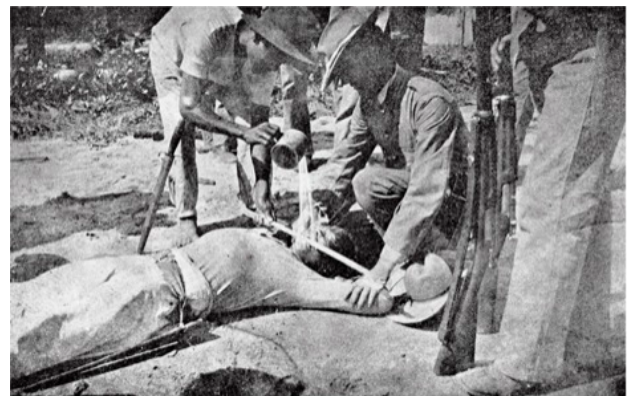
The water cure

soldiers to testify regarding the practice of torture, including the “water cure.” Their accounts triggered a response by Secretary of War Elihu Root that included the minimization of atrocity and the inauguration of court-martial proceedings for some soldiers and officers accused of torturing Filipinos.