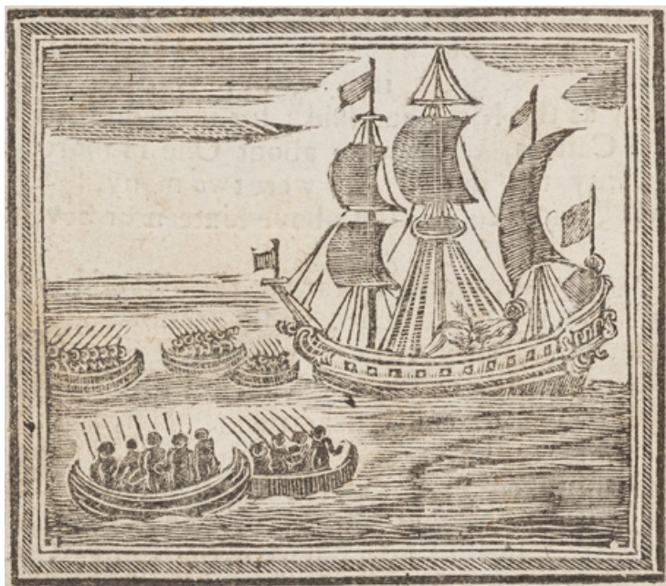
Figure 26 Woodcut depicting Friday's death, The Life and Adventures of Robinson Crusoe . . . The whole Three Volumes faithfully Abridg'd (London: A. Bettesworth, T. Brotherton and M. Hotham, 1722). Reproduced from a copy in the Beinecke Rare Book & Manuscript Library, Yale University.

shift of mode to make sense of the dual narrative of the edition's text-image framework. As a result, illustrations may collectively have been understood as a narrative sequence that – if not replicating – intersected with the typographical narrative by highlighting (and, in the process, assigning significance to) some scenes in favour of others. Compared with Taylor's sixth edition, Midwinter's woodcut frontispiece and the twenty-nine woodcut vignettes were distributed across 376 pages of text, which comprised both parts of