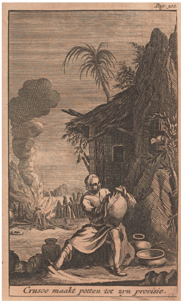
Figure 16 Copperplate of Crusoe as potter, Het Leven en Wonderbaare Gevallen van Robinson Crusoe (Amsterdam: de Jansoons van Waesberge, 1720). Reproduced from a copy in the Beinecke Rare Book & Manuscript Library, Yale University.