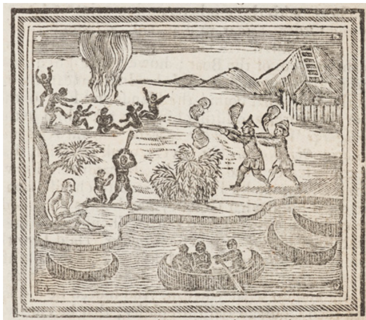
Figure 29 Woodcut rendering Crusoe and Friday killing the savages, The Life and Adventures of Robinson Crusoe . . . The whole Three Volumes faithfully Abridg'd (London: A. Bettesworth, T. Brotherton and M. Hotham, 1722). Reproduced from a copy in the Beinecke Rare Book & Manuscript Library, Yale University.

only for reasons governing the interpretive relationship the image entertains with the printed text. But it is also technologically conditioned, for – unlike copperplates, which had to be printed on separate paper stock and could not be printed as part of the typeset text – the physical woodblock was set alongside the type and printed at the same time. The spatial placement of the illustration is thus meaningful, since the typesetter, if not instructed