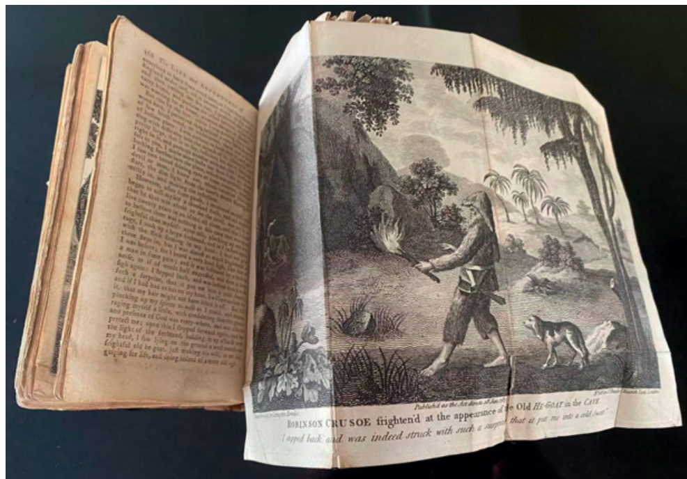
Figure 35 Extra-illustrated edition of Robinson Crusoe , 1778, featuring Carington Bowles's Crusoe prints. Reproduced from a copy in the author's collection.