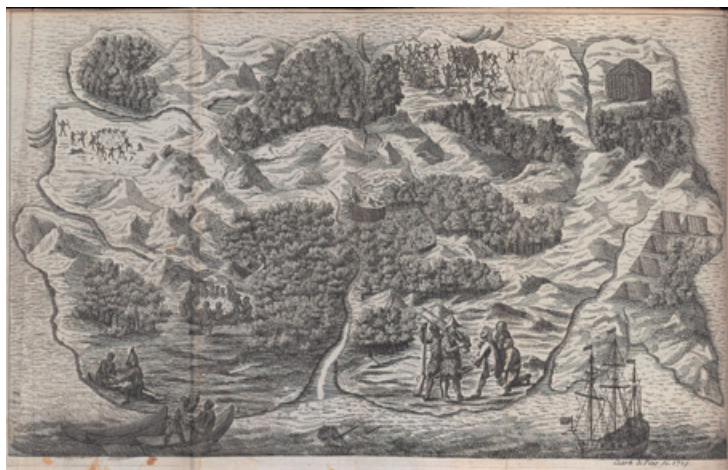
Figure 4 Copperplate ‘curious Frontispiece’ to Taylor’s 1720 edition of Serious Reflections , executed by Clark and Pine.

in Farther Adventures , the ‘curious Frontispiece’ ‘portray[s] . . . the island all by itself, disproportioned according to experience, independent of the surrounding Caribbean. . . . The island is a totally realized space, filled with both discrete objects and an ambient context that pulls them all together’ (Pearl, 2012, p. 139). Above all, however, it is the representation of settings (wooded areas, mountains, hills, rivers and instances of the built environment), human agents and the objects of mobility (canoes and ships), the latter invoking life beyond the island, which make them authentic to the reader eager to anchor the narrative iconically within the spatial matrix of the island given physical-representational shape by the map.