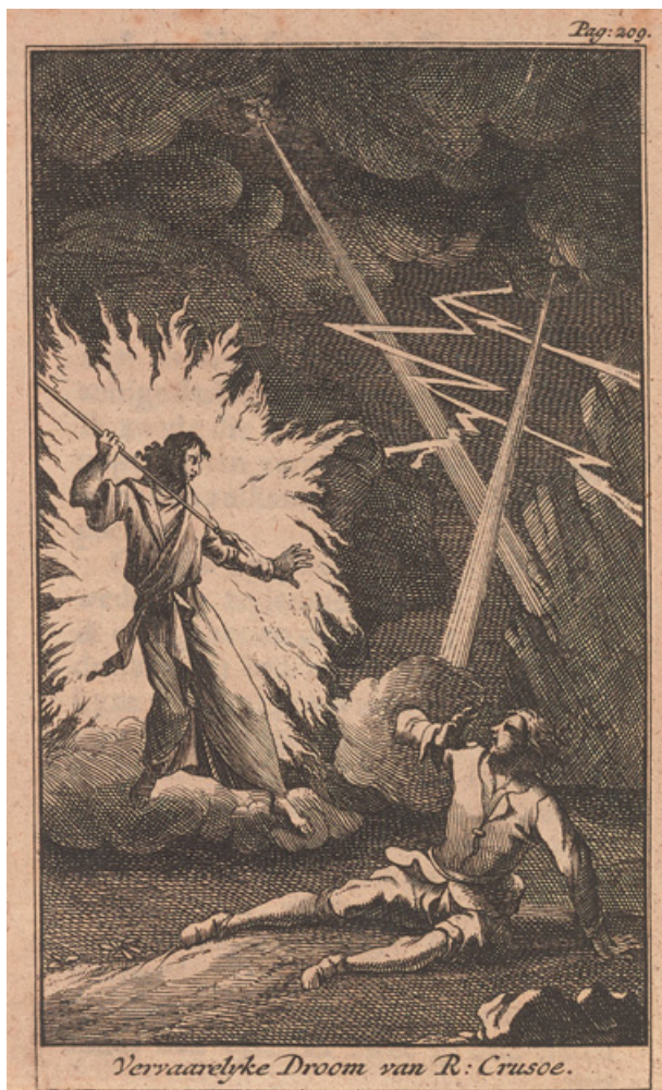
Figure 19 Copperplate of Crusoe's dream, Het Leven en Wonderbaare Gevallen van Robinson Crusoe (Amsterdam: de Jansoons van Waesberge, 1720). Reproduced from a copy in the Beinecke Rare Book & Manuscript Library, Yale University.