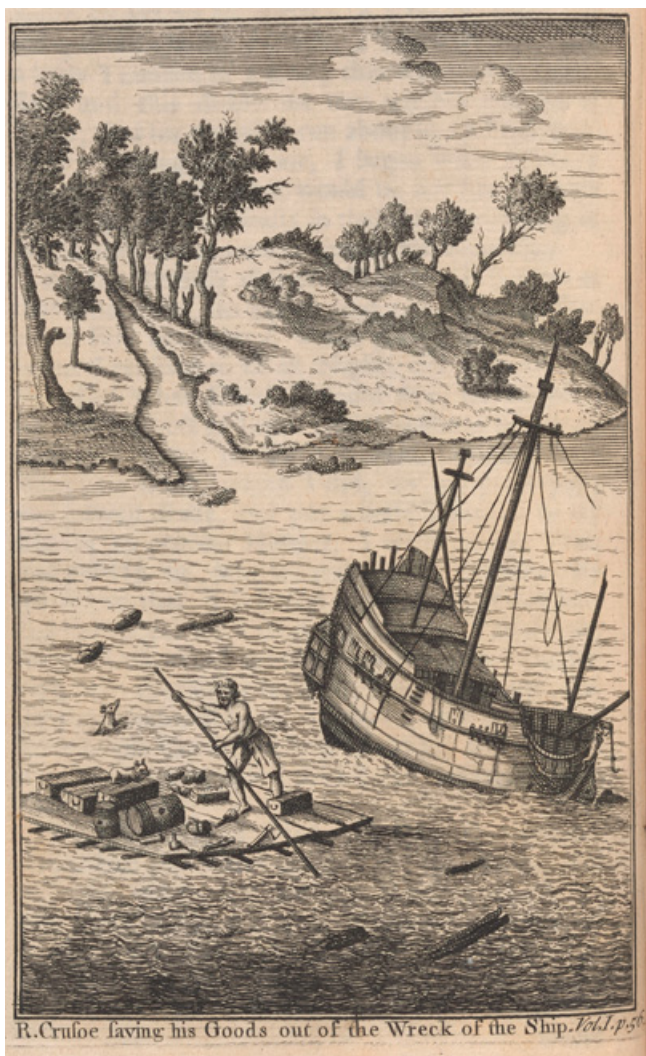
Figure 6 Copperplate of Crusoe salvaging goods from the wreck, 1721 Taylor edition [sixth edition]. Reproduced from a copy in the Beinecke Rare Book & Manuscript Library, Yale University.