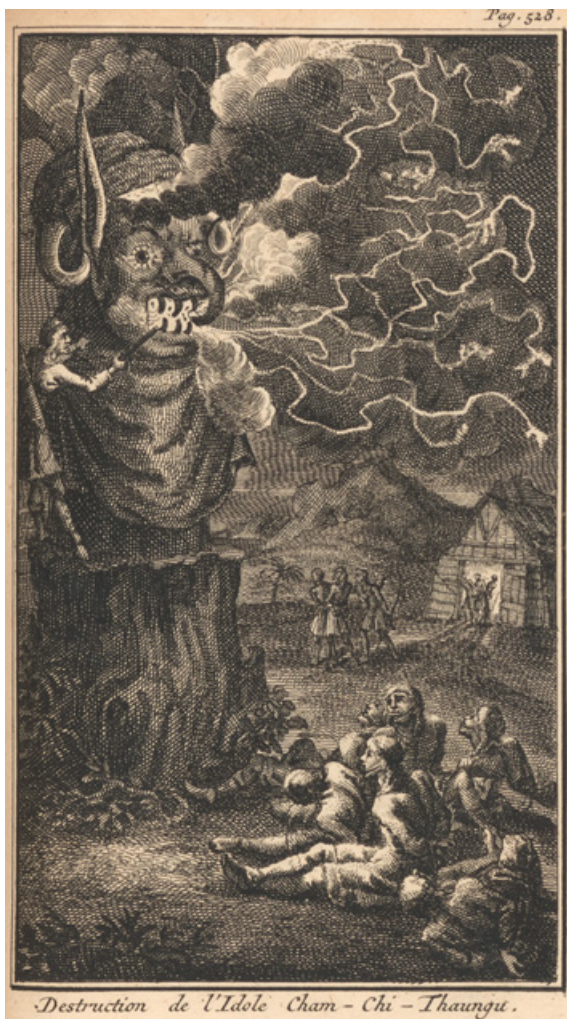
Figure 14 Copperplate of the destruction of the pagan idol, La Vie et les Aventures Surprenantes de Robinson Crusoe (Amsterdam: L'Honoré et Chatelain, 1720). Reproduced from a copy in the Beinecke Rare Book & Manuscript Library, Yale University.