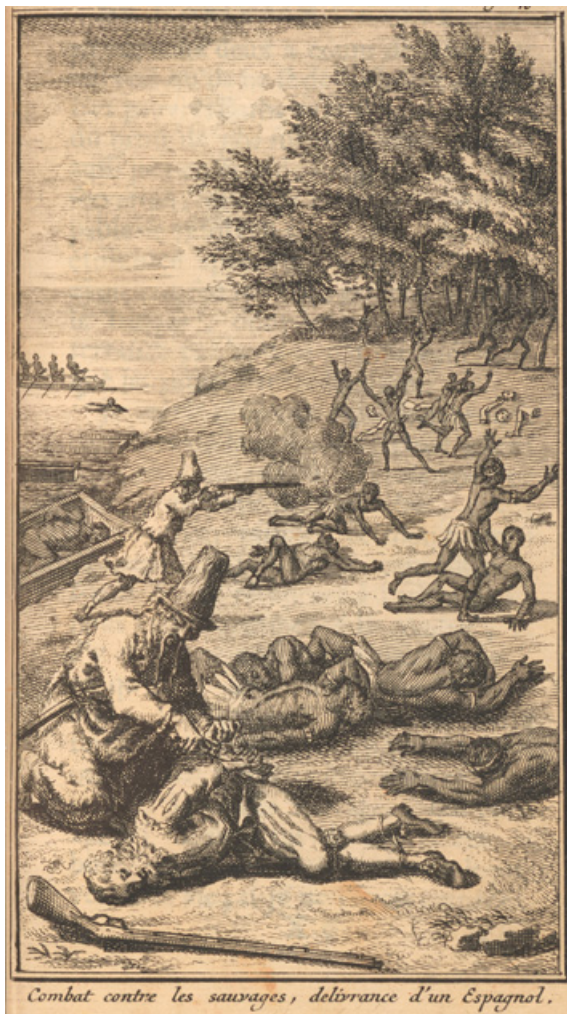
Figure 12 Copperplate of Crusoe's killing the savages and his delivery of the Spaniard, La Vie et les Aventures Surprenantes de Robinson Crusoe (Amsterdam: L'Honoré et Chatelain, 1720). Reproduced from a copy in the Beinecke Rare Book & Manuscript Library, Yale University.