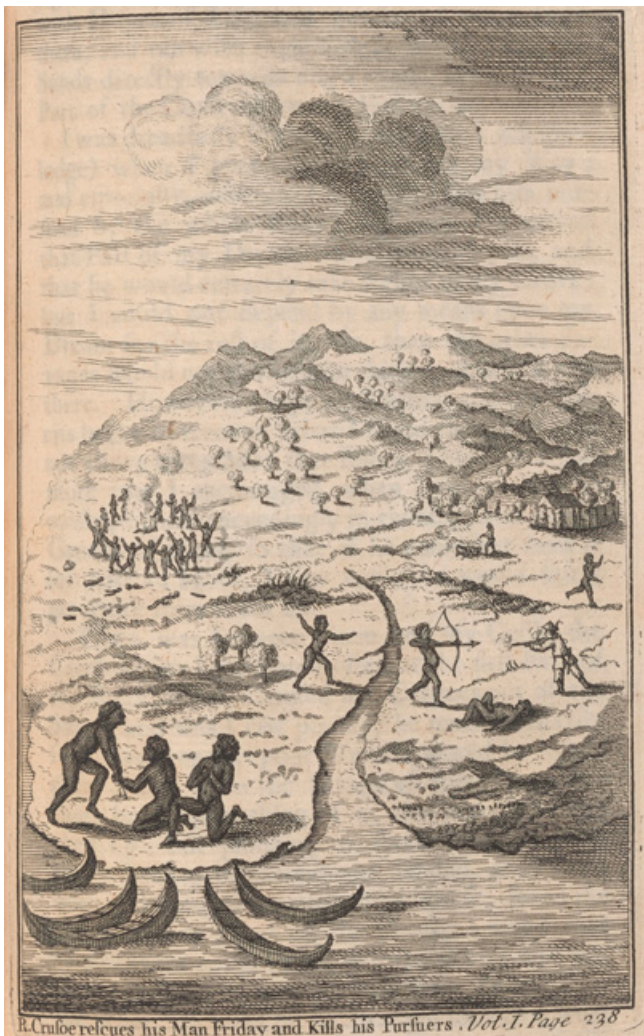
Figure 27 Copperplate of Crusoe rescuing Friday, 1721 Taylor edition.