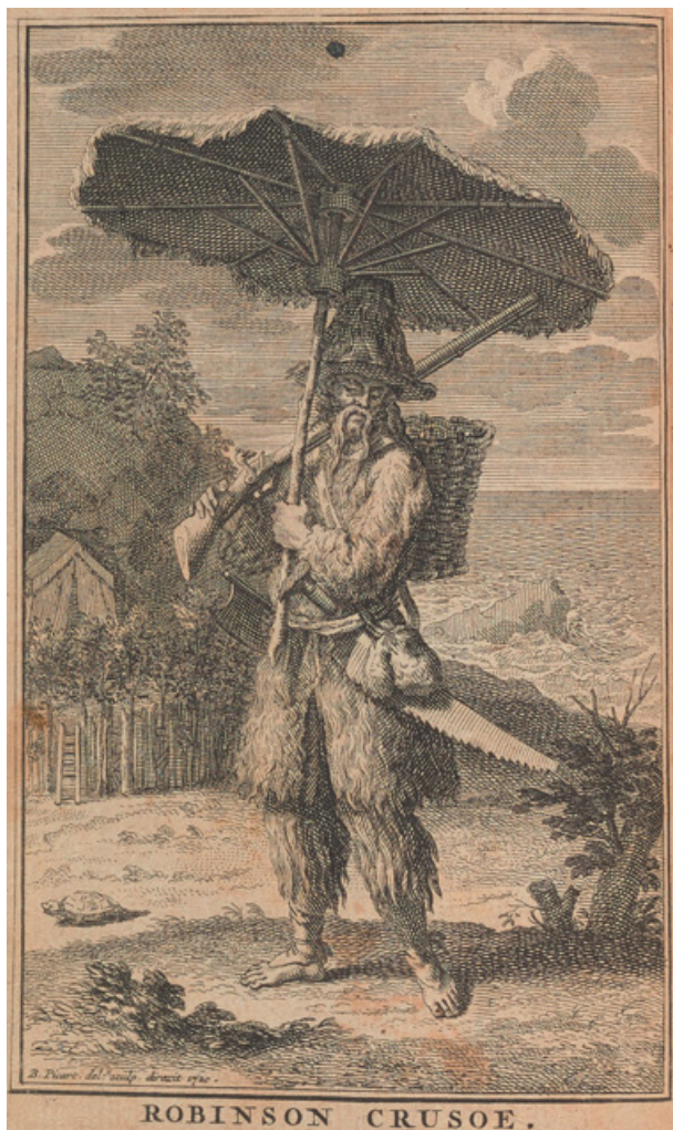
Figure 9 Copperplate portrait frontispiece, designed and executed by Bernard Picart, La Vie et les Aventures Surprenantes de Robinson Crusoe (Amsterdam: L'Honoré et Chatelain, 1720). Reproduced from a copy in the Beinecke Rare Book & Manuscript Library, Yale University.