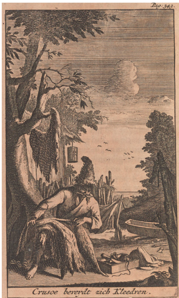
Figure 18 Copperplate of Crusoe producing his own clothes, Het Leven en Wonderbaare Gevallen van Robinson Crusoe (Amsterdam: de Jansoons van Waesberge, 1720). Reproduced from a copy in the Beinecke Rare Book & Manuscript Library, Yale University.