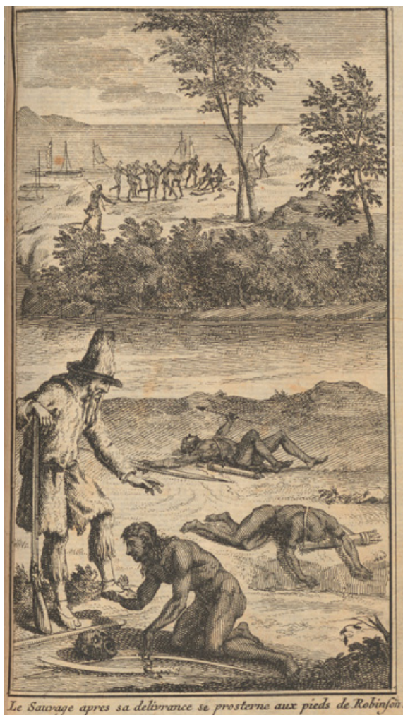
Figure 11 Copperplate of Friday's rescue, La Vie et les Aventures Surprenantes de Robinson Crusoe (Amsterdam: L'Honoré et Chatelain, 1720). Reproduced from a copy in the Beinecke Rare Book & Manuscript Library, Yale University.