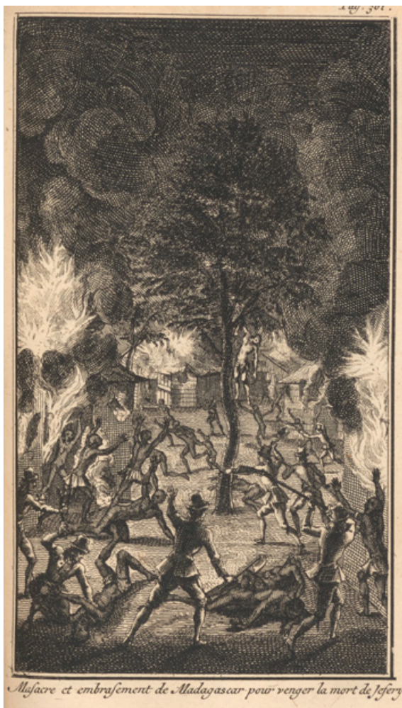
Massacre et embrasement de Madagascar pour venger la mort de Jéfery.

Figure 15 Copperplate of the massacre, La Vie et les Aventures Surprenantes de Robinson Crusoe (Amsterdam: L'Honoré et Chatelain, 1720).