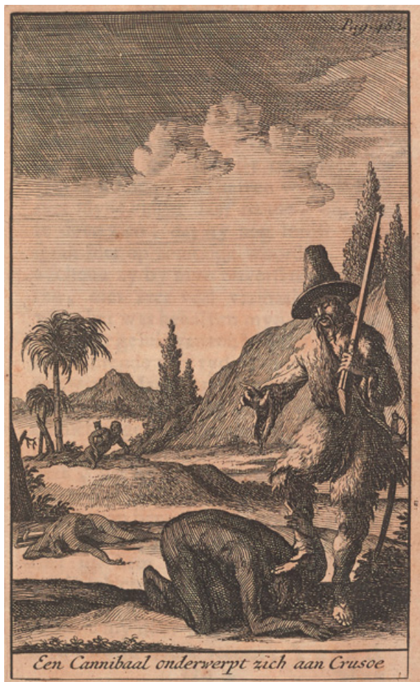
Figure 20 Copperplate of Friday's submission to Crusoe, Het Leven en Wonderbaare Gevallen van Robinson Crusoe (Amsterdam: de Jansoons van Waesberge, 1720). Reproduced from a copy in the Beinecke Rare Book & Manuscript Library, Yale University.