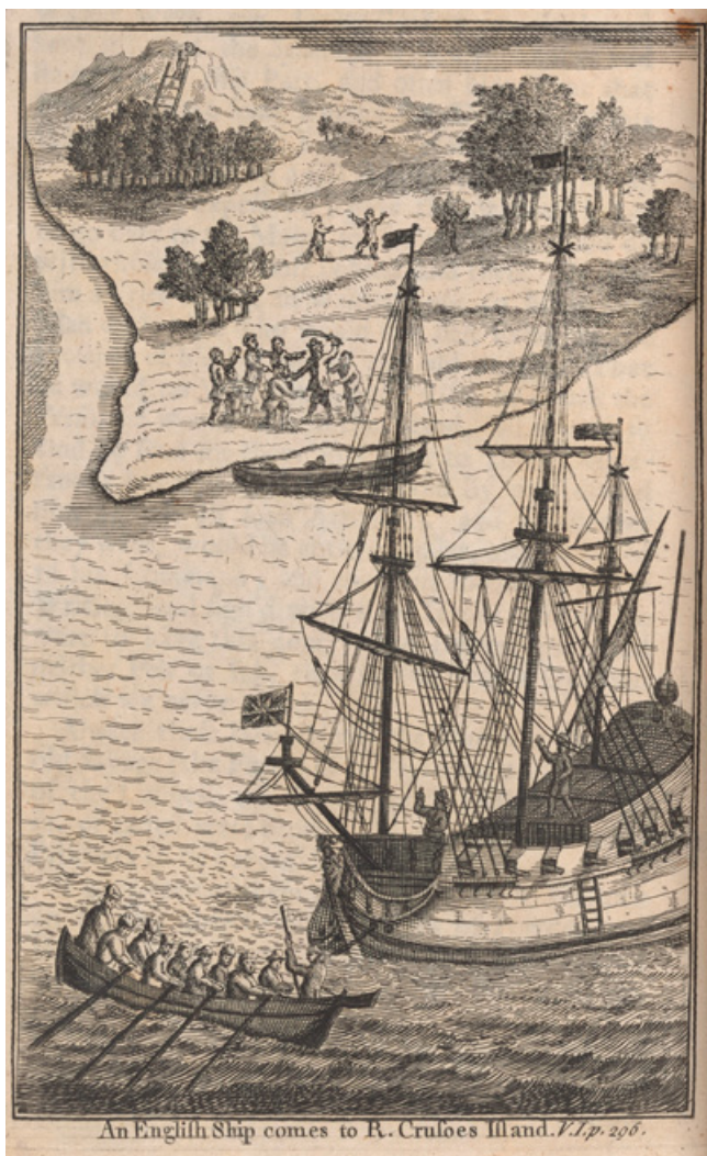
Figure 8 Copperplate of Crusoe saving the English captain, 1721 Taylor edition.