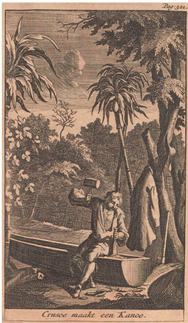
Figure 17 Copperplate of Crusoe constructing a boat, Het Leven en Wonderbaare Gevalen van Robinson Crusoe (Amsterdam: de Jansoons van Waesberge, 1720). Reproduced from a copy in the Beinecke Rare Book & Manuscript Library, Yale University.