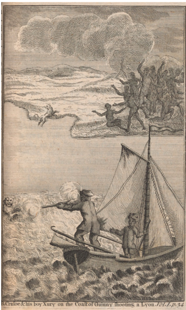
Figure 5 Copperplate of Crusoe shooting a lion, 1721 Taylor edition [sixth edition]. Reproduced from a copy in the Beinecke Rare Book & Manuscript Library, Yale University.