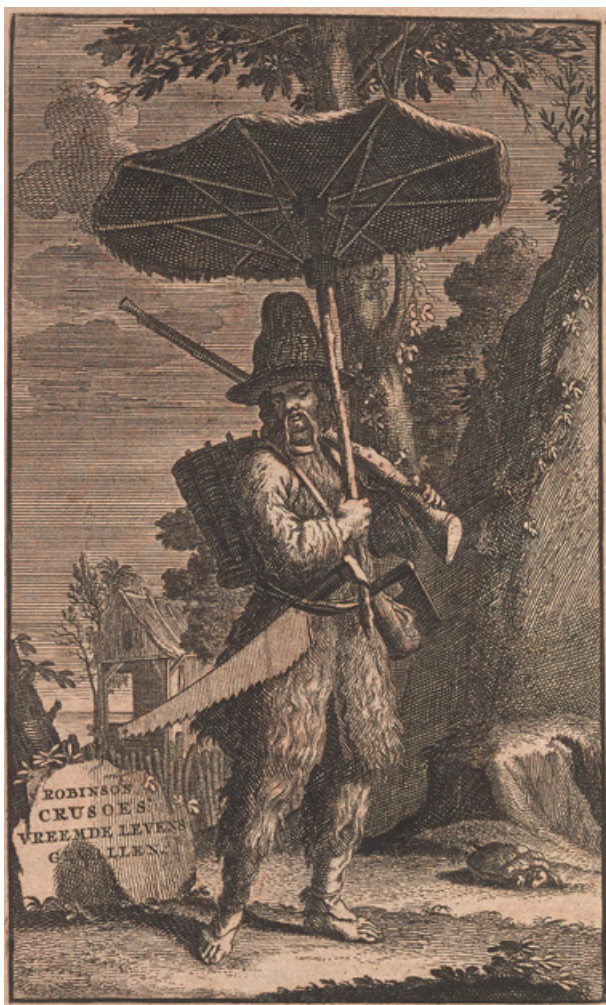
Figure 10 Adapted copperplate portrait frontispiece, Het Leven en Wonderbaare Gevalen van Robinson Crusoe (Amsterdam: de Jansoons van Waesberge, 1720). Reproduced from a copy in the Beinecke Rare Book & Manuscript Library, Yale University.