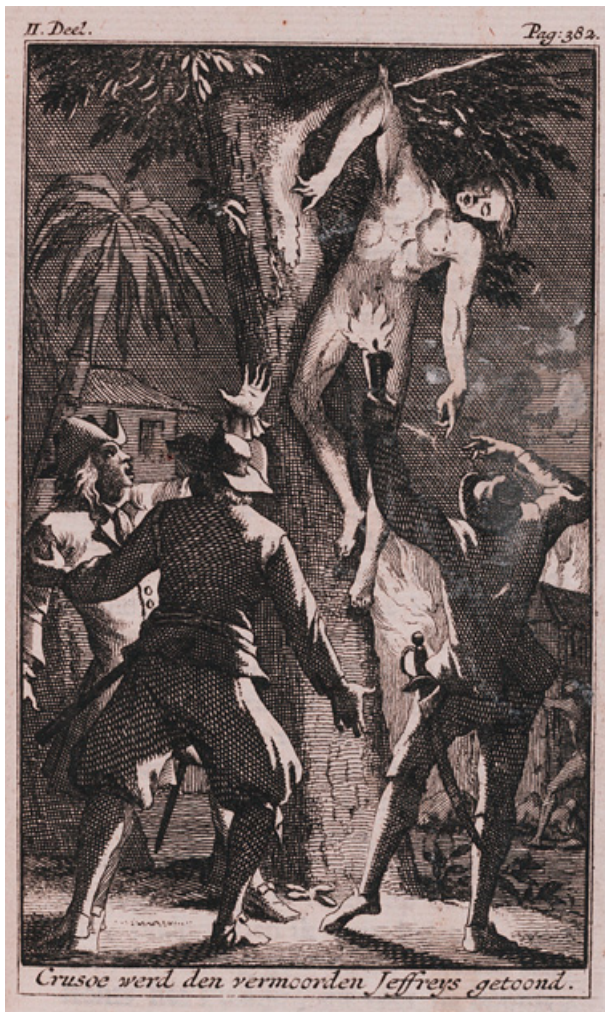
Figure 21 Copperplate of Crusoe being shown the murdered Tom Jeffry, Het Leven en Wonderbaare Gevallen van Robinson Crusoe (Amsterdam: de Jansoons van Waesberge, 1720). Reproduced from a copy in the Beinecke Rare Book & Manuscript Library, Yale University.