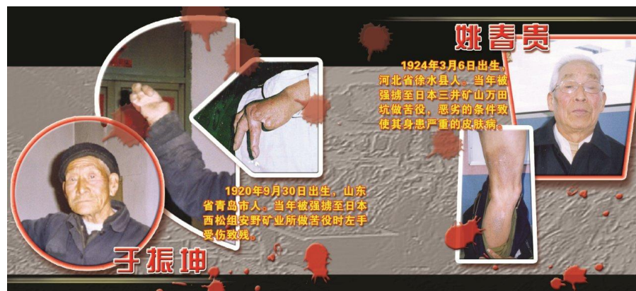
Chinese-language materials used to rally support for the strong redress claim stemming from Chinese forced labor. The man at left worked at the Nishimatsu Yasuno site, while the man at right was pressed into unpaid service for Mitsui & Co.

As the Nishimatsu-Shinanogawa settlement negotiation stemmed from the lawsuit claims for damages by the plaintiffs, both parties established the principle at the initial stage of negotiation that the plaintiffs in the litigation be the representatives of the victims' side throughout the negotiation.