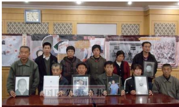
The five plaintiffs in the Shinanogawa lawsuit against Nishimatsu, along with heirs of two other victims, announce their opposition to the compensation pact at a Beijing press conference on April 27.

to ambiguously name the damages that they should have paid to the Chinese victims; and (c) Moreover, Nishimatsu unreasonably requires those who accept the "settlement" to bear hereafter the obligation of ensuring that the corporation will be immune from any future liability from any other parties for this case. This article discusses these and other shortcomings of the unacceptable "settlement" in detail.