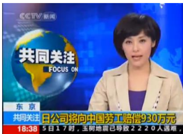
Chinese news coverage of the Nishimatsu-Shinanogawa settlement and its rejection by plaintiffs involved in the lengthy litigation.

As the agent of the Chinese plaintiffs, the author therefore issued a protest letter to Nishimatsu on April 19, 2010, but the corporation has not made any response. In the Settlement Agreement signed on April 26, 2010, Nishimatsu continued to include the plaintiffs who had already openly stated their rejection of this Settlement Agreement in its "settlement" arrangements. While Nishimatsu has yet to resolve its wartime forced labor issue, it violates de facto the human rights of the Chinese forced labor victims once again.