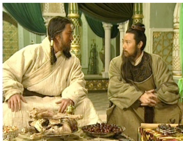
Figure 10. Yelü Chucai advising Chinggis Khan in Chengjisi Han (2004).

Daoist sage. 109 These men imbue in Temüjin an appreciation for the value of learning and scholarship for administering an empire, with particular attention to the three great teachings of China: Confucianism, Buddhism, and Daoism.