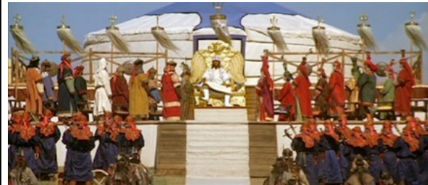
Figure 5. Coronation of Chinggis Khan in 1206, as recreated in The Blue Wolf: To the Ends of the Land and Sea (2007).

Army soldiers, along with local support staff, and they made up the main form of Mongolian participation. 55 It is fair to say that The Blue Wolf is more representative of Japanese fascination with Chinggis Khan and of a Japanese re-imagining of his life story, than of a Mongol perspective.