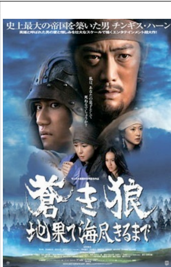
Figure 4. The Blue Wolf: From the End of the Earth and Sea (directed by Sawa Shinichirō, 2007).

While The Blue Wolf was billed as a Japan-Mongolia co-production shot on location in Mongolia over a four-month period in 2006, Mongolians were no happier with it than they were with Bodrov's Mongol . The Blue Wolf was the personal project of co-producer Kadokawa Haruki, a publisher and film director who had conceived of a movie project on Chinggis Khan 27 years before it finally came to fruition.