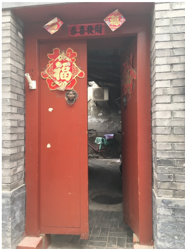
The entry to a residential courtyard in the hutong near Houhai

temporary tactical withdrawal of state intervention. The ultimate arbiter of power at the time, he was responsible for the brutal decision to open fire in 1989, and for the unjust arrests that followed, but he soon got boxed in the party conservatives who were lending him their support in their own quest to consolidate power. Deng's secretive "Southern Tour" in January 1992 bore imperial echoes of Emperor Kangxi's "nanxun" near the end of his reign and marked a return to a relatively unfettered process of reform and opening.