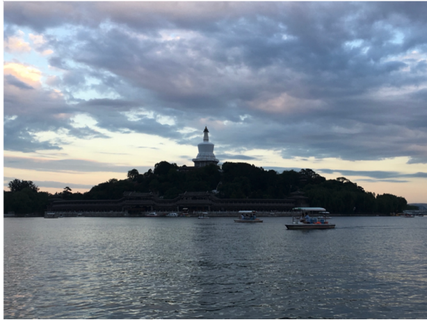
A view of Jade Flower Island (Qionghuadao) as seen from a pleasure boat in Beihai

archaeological remnants can be found nestled in a district still defined by walled compounds, man-made hills and lakes. The epicenter of the old, old city corresponds with Beihai Park today, and it is there that the denouement of the novel takes place.