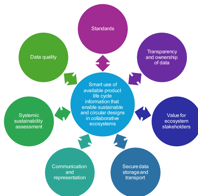
Figure 2. A shared vision with critical areas representing an ideal state where sustainable and circular products are developed based on enriched information from the value chain

A shared vision of the desired future state was formulated in the project team and validated together with an extended team, outside the project team in a physical workshop. It is based on a common belief in that an increased volume of information that is clearly linked to products through the DPP legislation, will be enabled by the expanded use of sensors and digital traceability technologies. If this scenario becomes real, it will strengthen the interaction between the integrators (OEM's) and their suppliers. The ability to benefit from this tightened interdependency among the value chain actors open for “smart” innovation in the sustainable and circular dimension. The vision was defined as “ Smart use of available product life cycle information that enable sustainable and circular designs in collaborative ecosystems ” see figure 2.