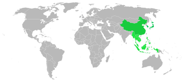
ASEAN Plus Three

Even more important, these countries have built up financial reserves by running massive trade surpluses, an objective they have achieved by keeping their currencies undervalued. Between 2001 and 2005, according to Nobel laureate Joseph Stiglitz, eight East Asian countries -- Japan, China, South Korea, Singapore, Malaysia, Thailand, Indonesia, and the Philippines -- more than doubled their total reserves, from roughly $1 trillion to $2.3 trillion. China, the leader of the pack, is estimated to now have over $900 billion in reserves, followed by Japan.