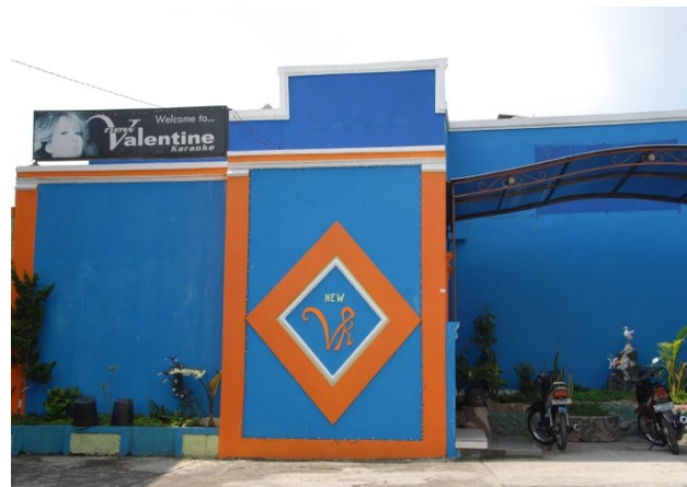
Vista near Bandungan

takes the badly marked shortcut from Bergas to Bandungan. Winding through stunning rice fields and bamboo groves, this road is beautiful but it would hardly please the piercing eyes of pious religious believers: its edges are dotted with one-hour hotels, karaoke clubs and pubs. In these parts of Central Java it is not uncommon to see lone sex workers descending from the hills along the road, in high heels and short skirts, still shaky after long nights of heavy alcohol consumption.