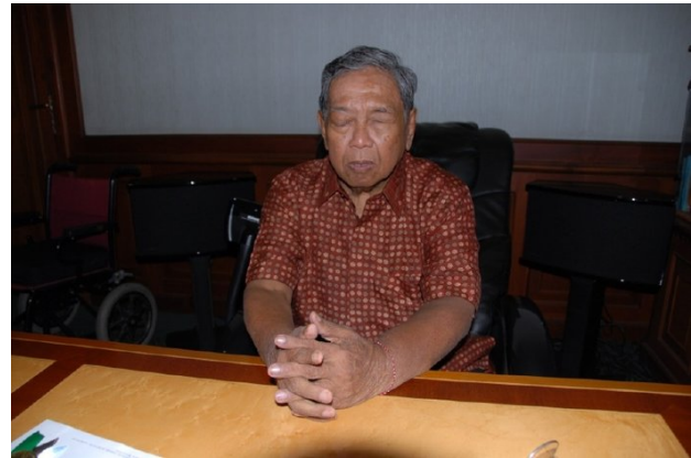
President Abdurrahman Wahid (Gus Dur)

It is true that the mainstream press and academia used plenty of self-restraint for decades with respect to Indonesian religious excesses connected to the genocides in East Timor and Papua, as well as the mass slaughter that accompanied Suharto’s US-sponsored coup of 1965/66 in which between 500.000 and 3 million people died (there has been no official investigation to provide authoritative figures to this day). Seven years ago I discussed the issue with the former President of Indonesia – Abdurrahman Wahid (popularly known as Gus Dur). At that time he was still the head of NU (Nahdlatul Ulama – the largest Muslim organization in the world) and he apologized on camera to the victims of 1965/66 because, as he said “I do not want Islam to go down in history as a bigoted religion.” (Documentary film: “Terlena – Breaking of a Nation”, 2004).