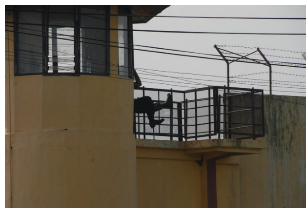
High security prison Porong, East Java, where some terrorists are doing time