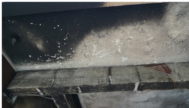
Burned Ceiling of One of the Temanggung Churches

Twice in the same week two gruesome attacks shook Indonesia and the world. On February 6, 2011, in Cikeusik Village, West Java - more than 1.000 furious Muslims lynched three members of a minority (or, as seen by some Muslims, 'deviant') Islamic sect Ahmadiyah. Two days later, on February 8 in Temanggung, Central Java, a crowd stormed a local courthouse and vandalized three churches after a man - a former priest who allegedly insulted both Islam and Christianity in his pamphlet - was sentenced to five years in prison, the maximum sentence. Protesters demanded the death penalty. A third attack soon followed.